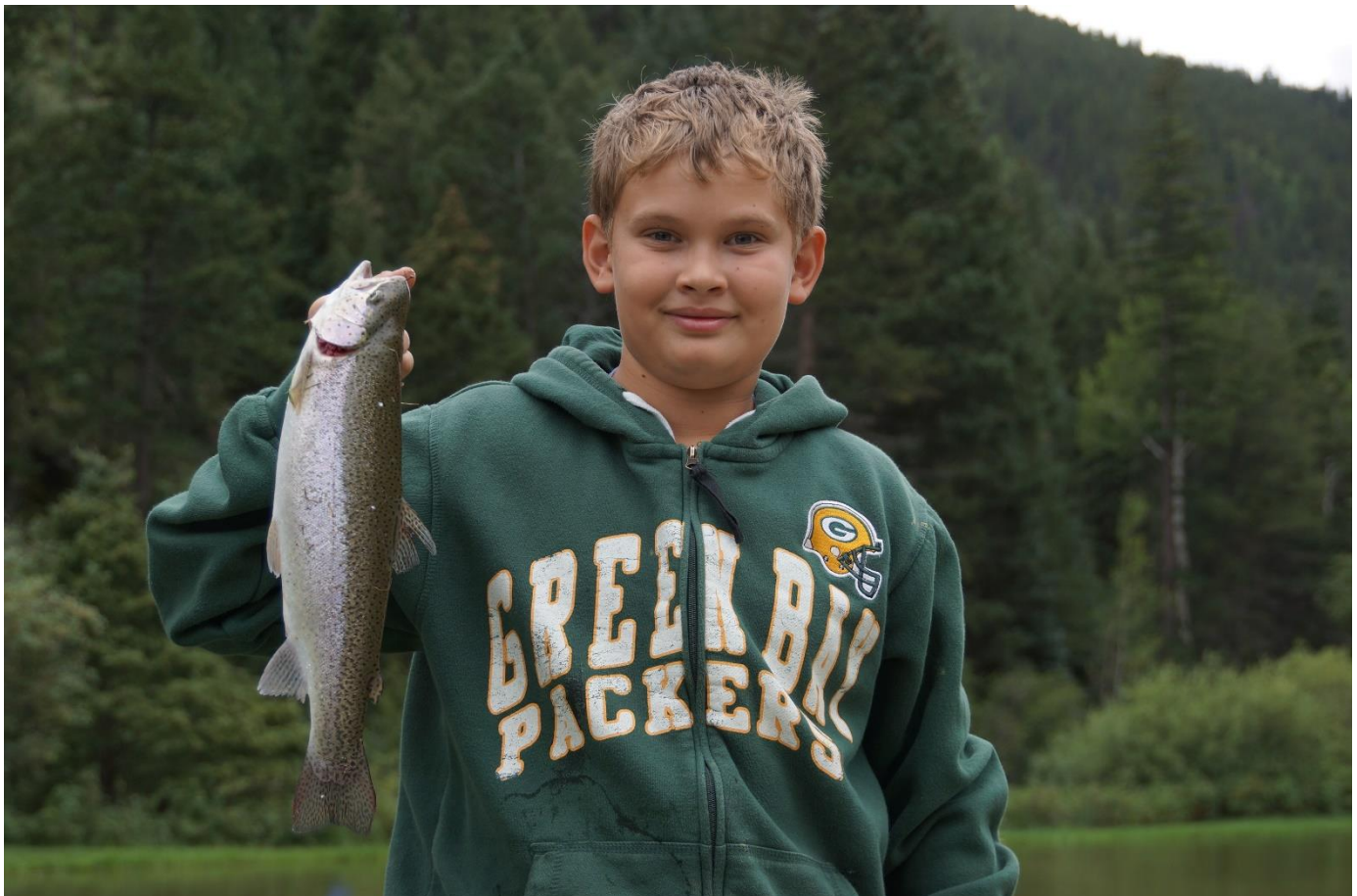
In 2013 he catches a great Rainbow Trout in Colorado.