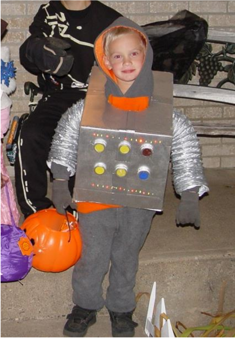
Halloween as a computer, 2006.