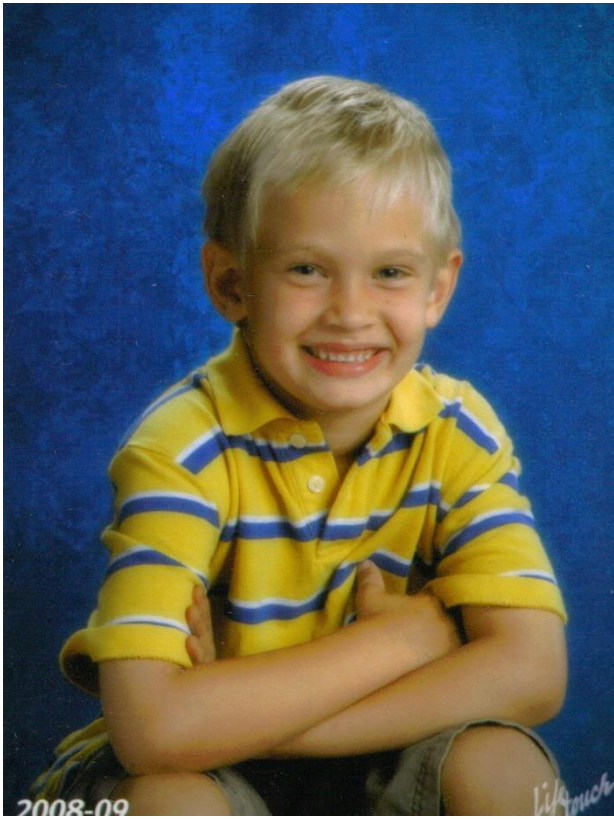
Left, school photo in 2008.