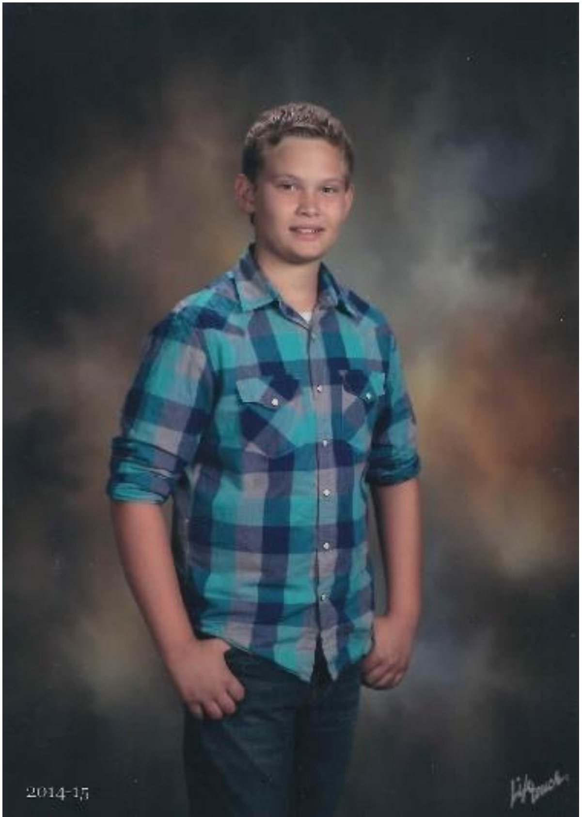
2014 school photo.