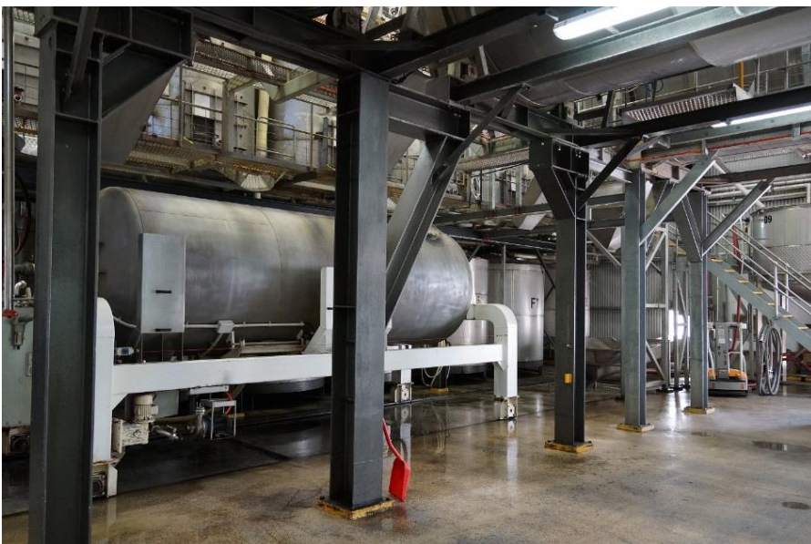
Brand's Laira Winery.