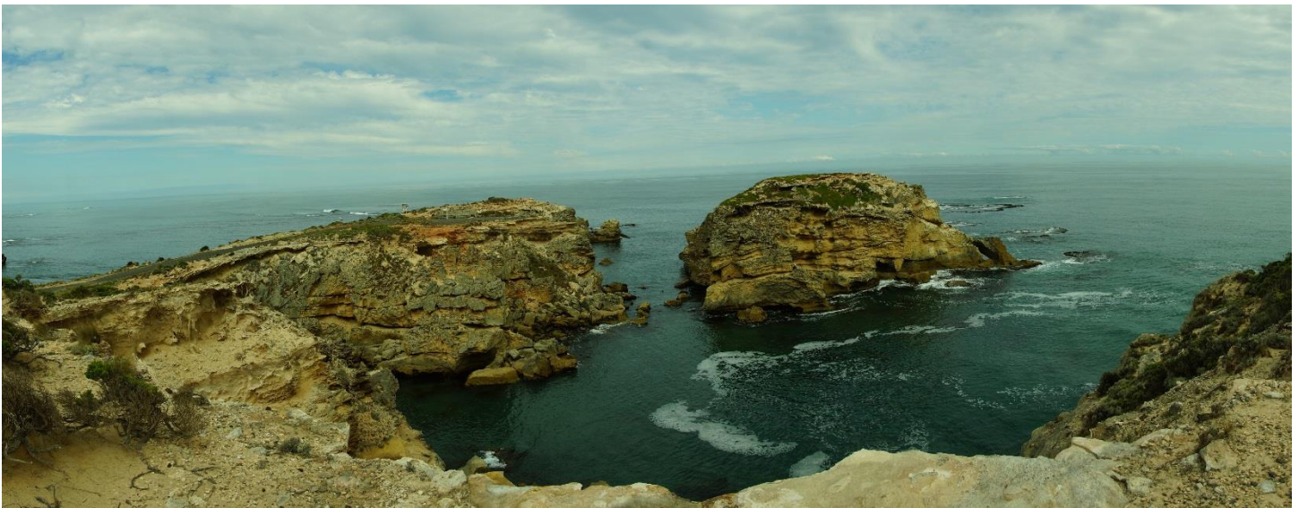
We toured the "Shipwreck Coast" near Mt. Gambier.