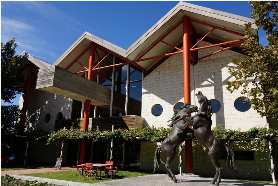
Rymill Coonawara Winery.