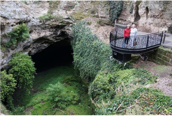
Mt. Gambier's beautifully landscaped sink hole next to the government center in the center of the city.