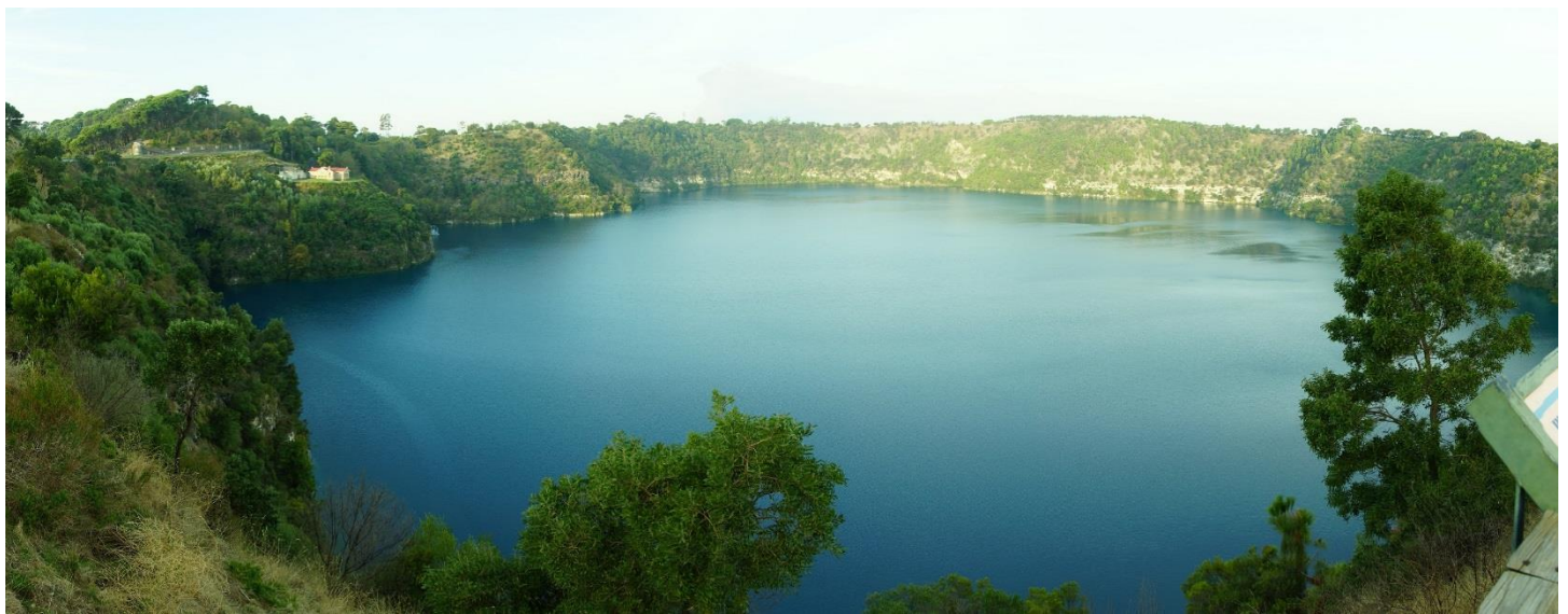
Blue Lake, a 230 foot deep volcano crater which fills with limestone filtered water from the bottom. It supplies Mt Gambier, a city of 25,000, with clean water. Note the pumping station on the left.