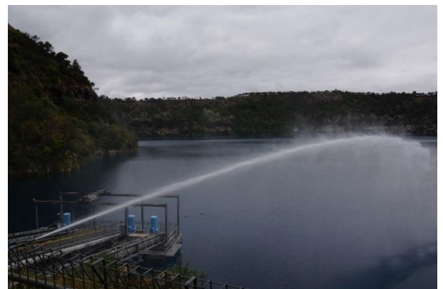
Left: Our group touring the cities pumping station. The water is pumped up to the highest hill above the city and provides a pressure of 1200 liters per second (right).