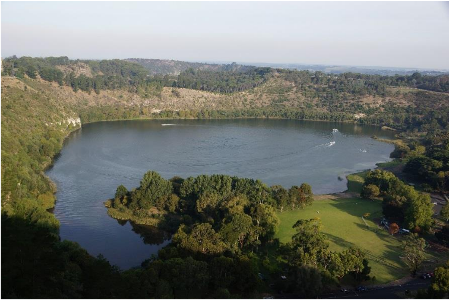
Brown's Lake one of the 4 lake craters in the city.