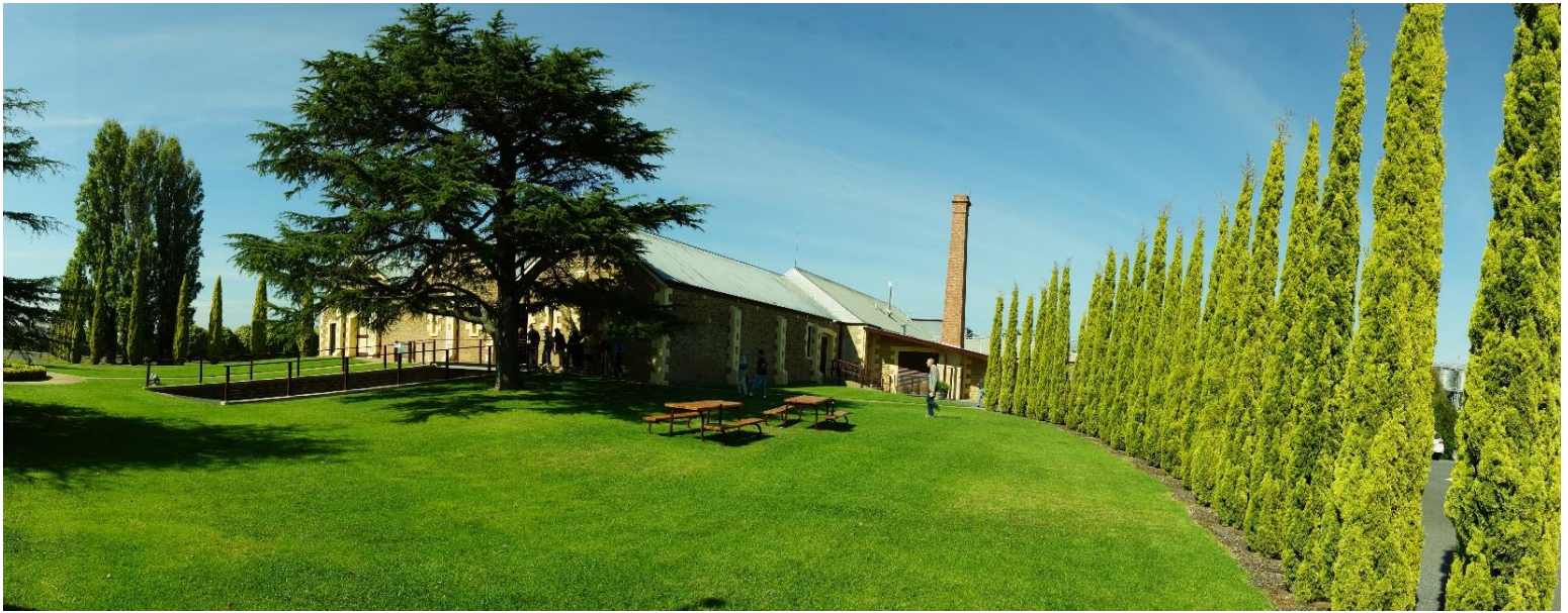
Our group toured 5 wineries around Mt. Gambier. Above is Wynn's Winery. The others were Caroline Hills, Herbert Vineyard, Brand's Laira and Rymill Coonawara Winery.