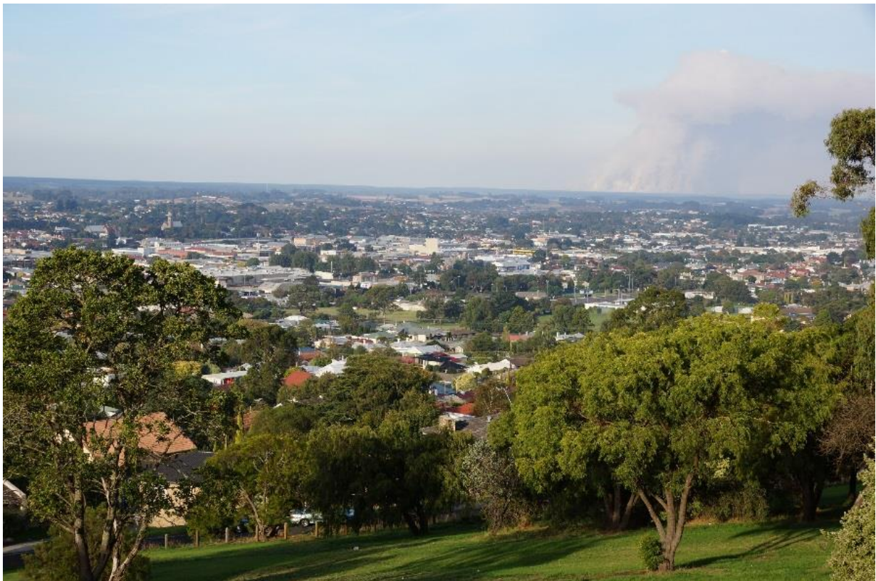
A view of the city of Mt. Gambier.