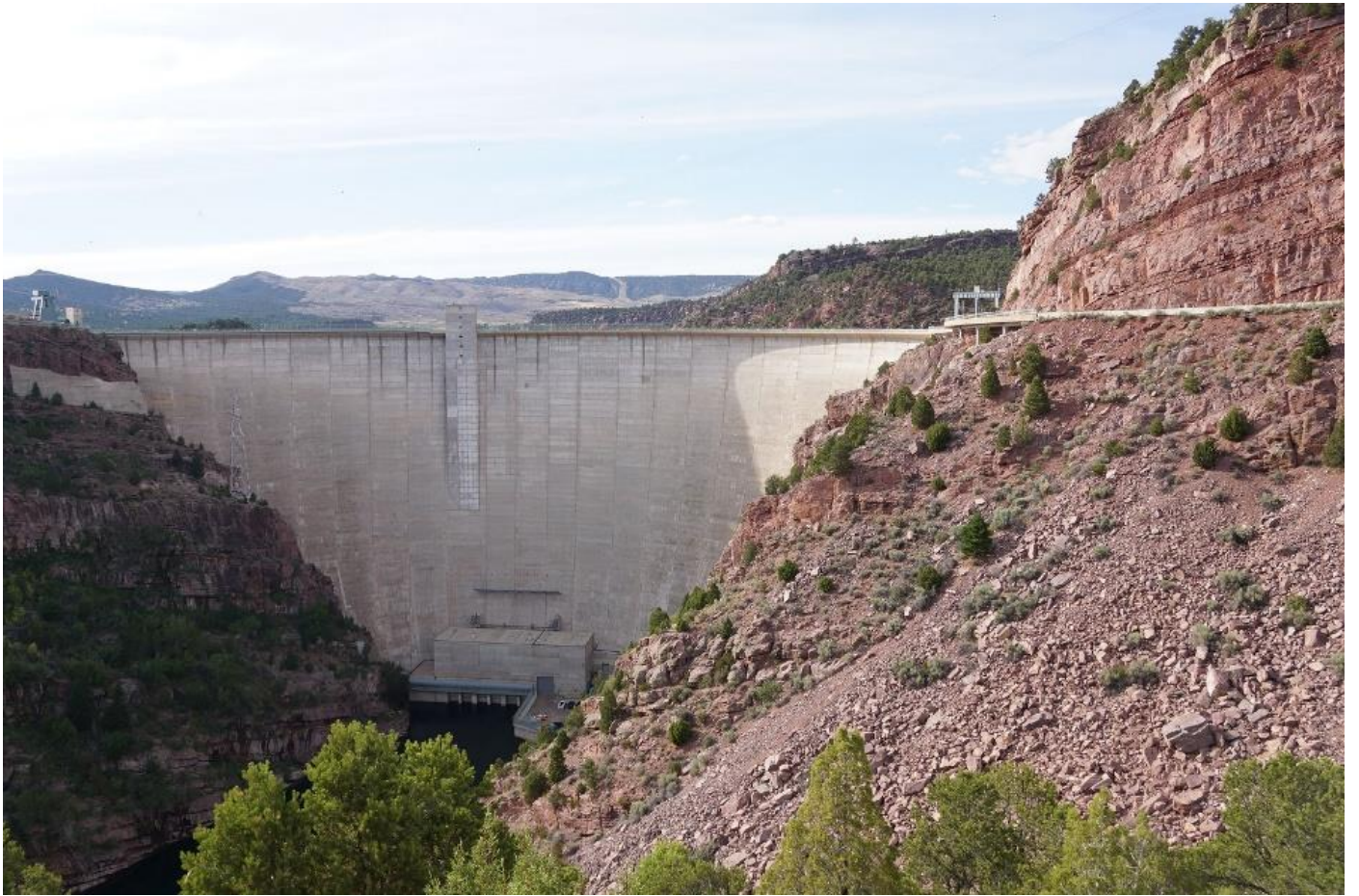
The 502' by 1,285' foot Flaming Gorge Reservoir Dam.