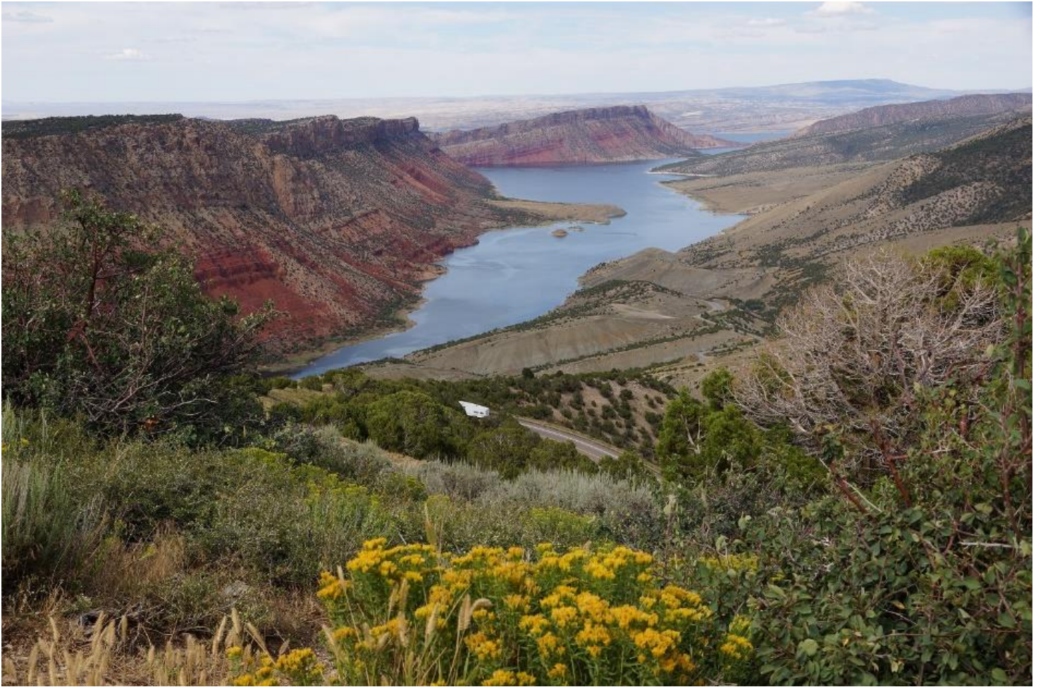
Above: From the highest viewing area. Below: Bridge as we approach the dam.