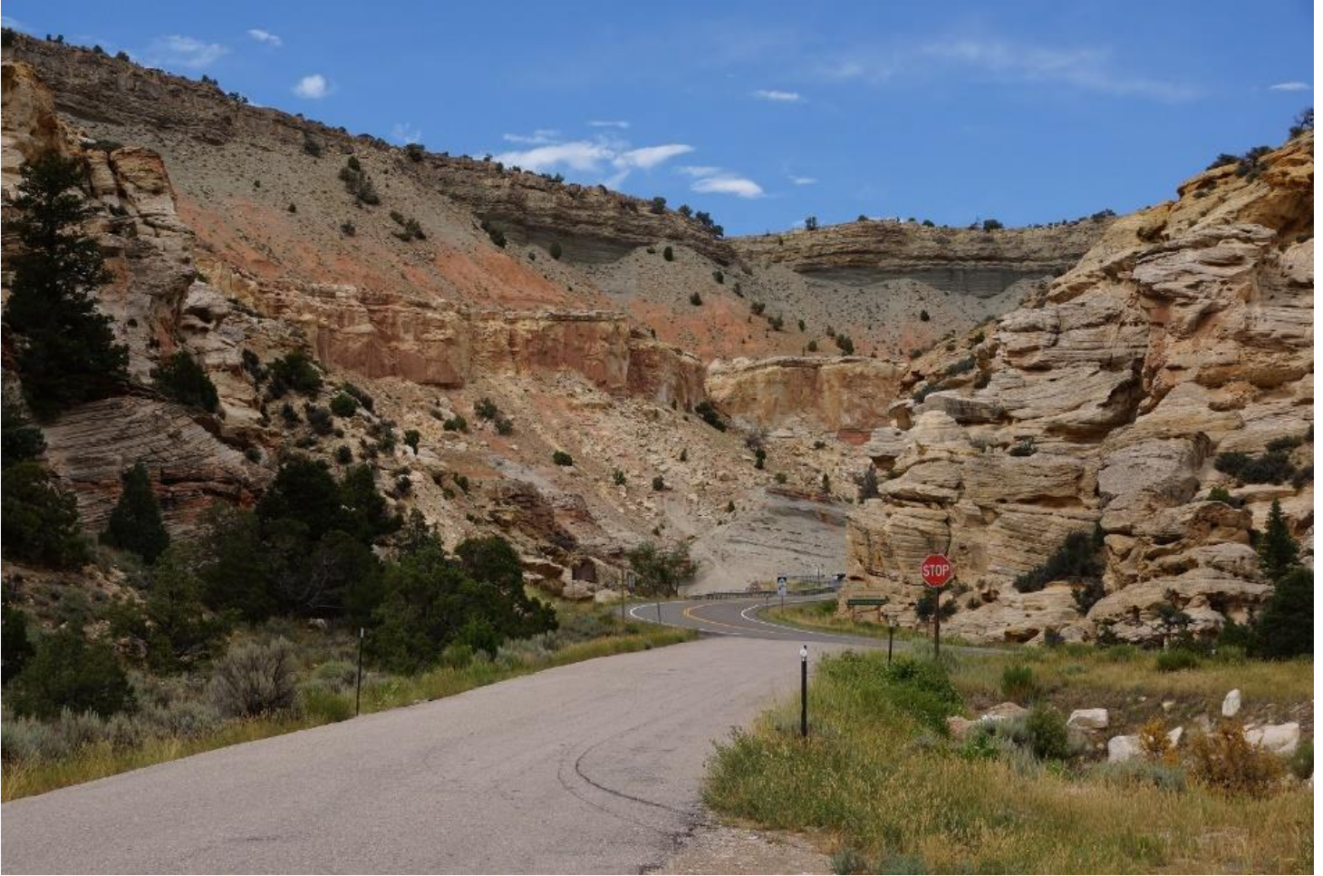
The drive around the reservoir has many deep red canyons.