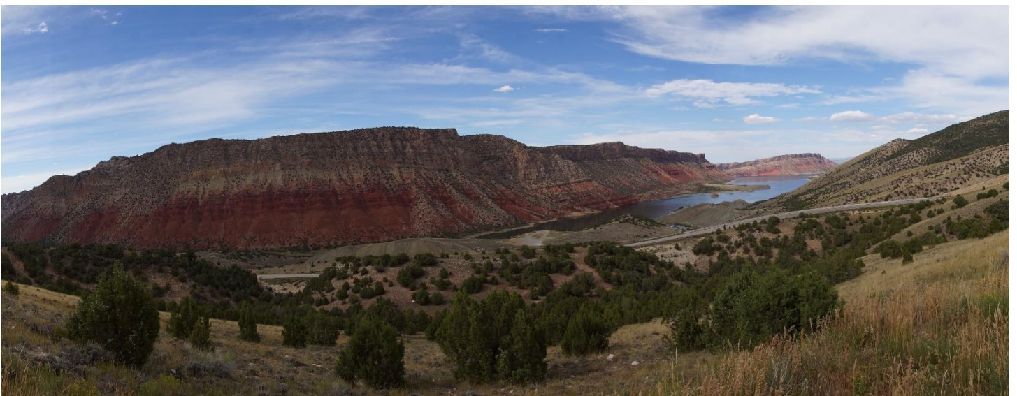
Panoramic of the same cliff.