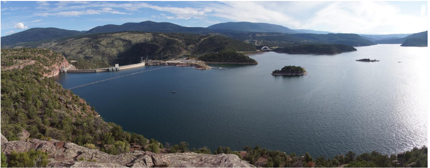
Panoramic of the bridge, dam and reservoir.