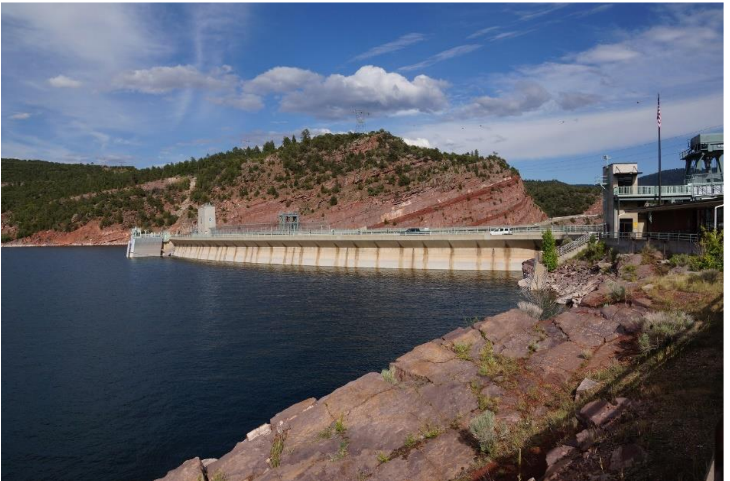
The Flaming Gorge Dam.