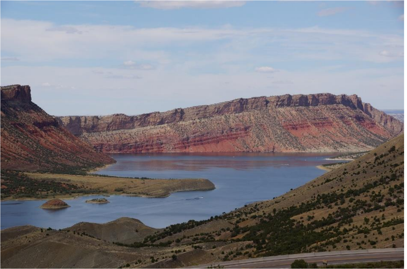
Two views of the same cliff from different altitudes.