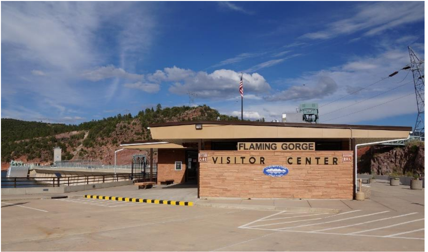
The Flaming Gorge Visitor Center on the dam.