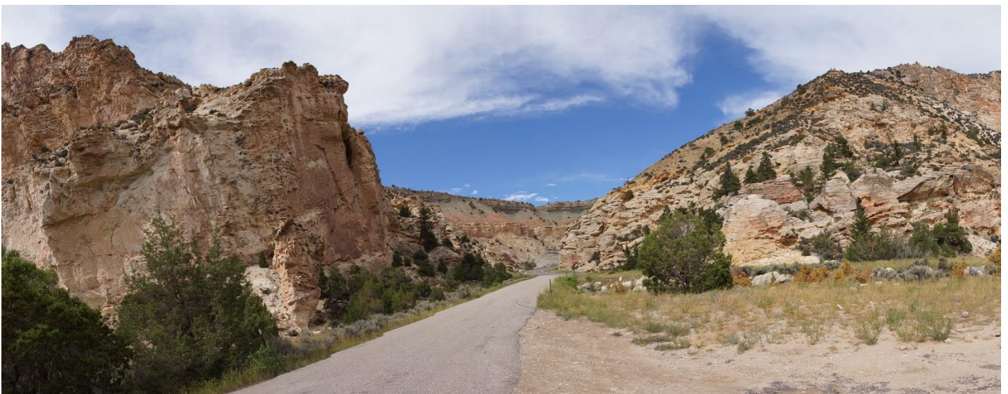
Panoramic of the same canyon.