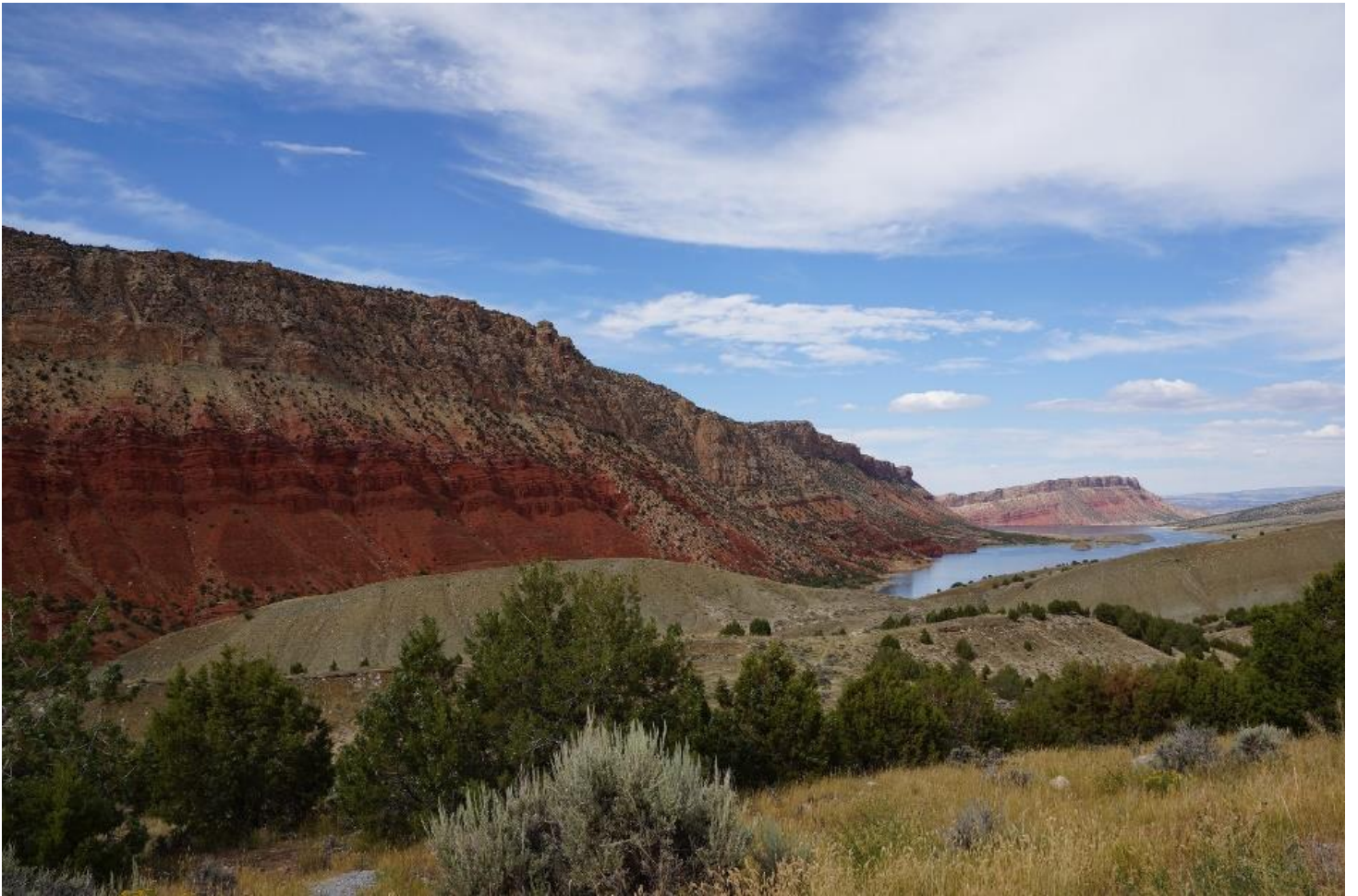
The cliffs become very red as we approach the water of the reservoir.