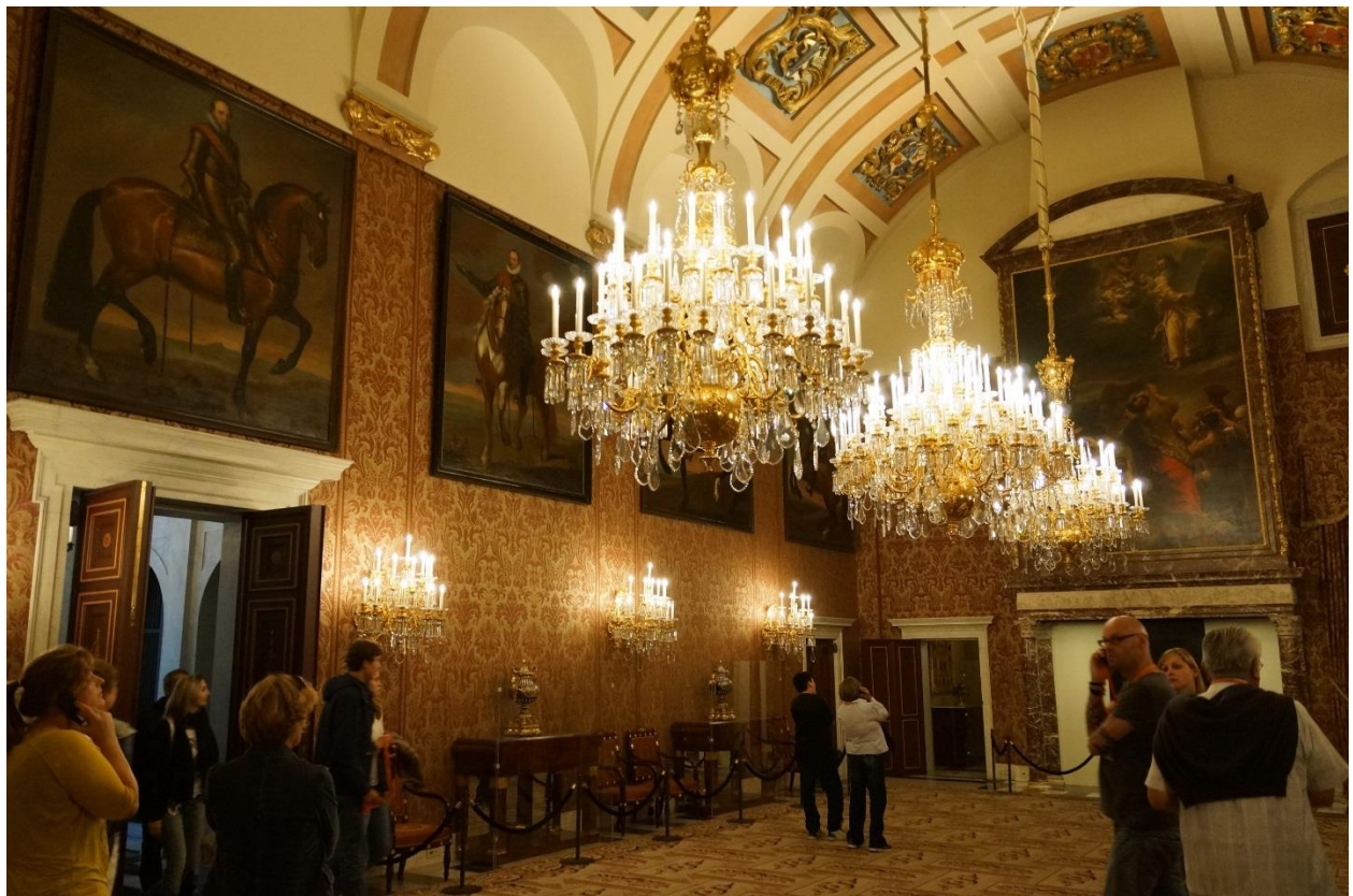
This room illustrates the elaborate crystal chandeliers that are present in nearly every room in the Palace.