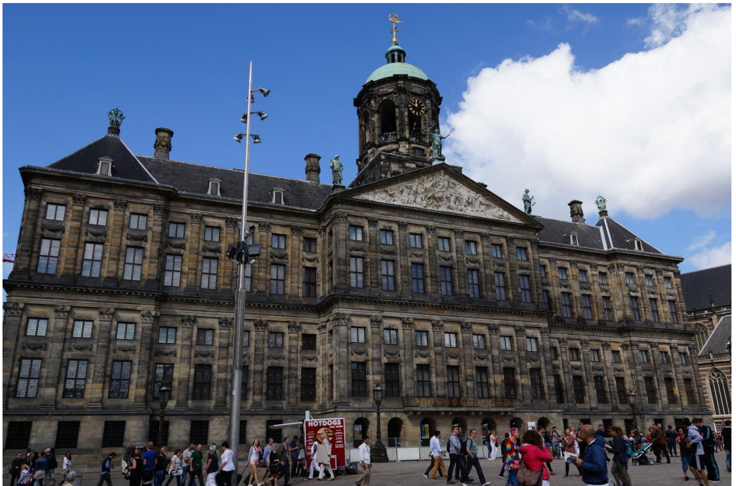
The Royal Palace is one of three palaces used by the Royal House. This is where His Majesty the King receives visiting heads of state and hosts symposiums, award ceremonies, dinners and receptions. At other times the Palace is open to the public. There are no flash photos allowed in the Palace. All the following photos in the Palace were without flash.