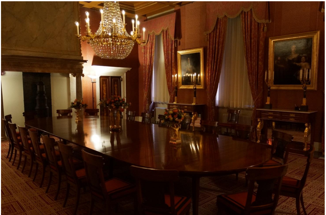
Palace Dining Room