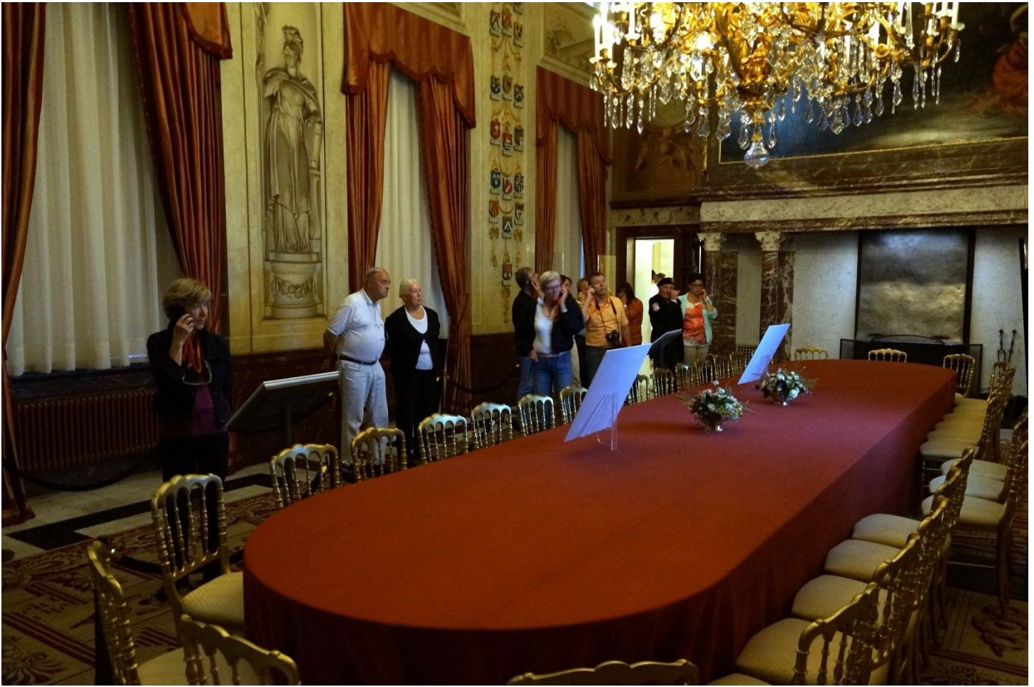
On April 30, 2013 Queen Beatrix and Prince Willem-Alexandar signed the Instrument of Abdication making the Prince the King. This room is called the Council Chamber.