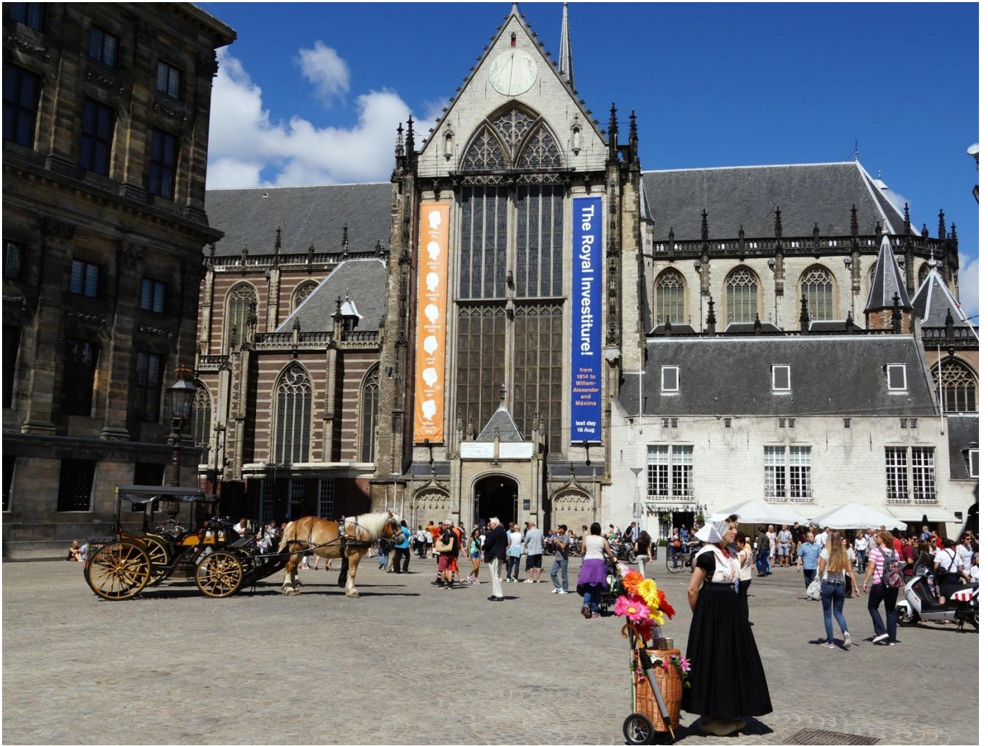
Above: The New Church is to the right of the Royal Palace in Dam Square. It is used only by the royalty for coronations and weddings of the Royal Family and for organ recitals. Below: The back of the New Church. The building cost 15 Euro's per person to tour. No photos are allowed.