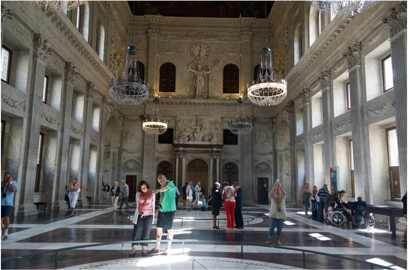
The Central Hall of the Royal Palace includes maps of the world in mosaic on the floor.