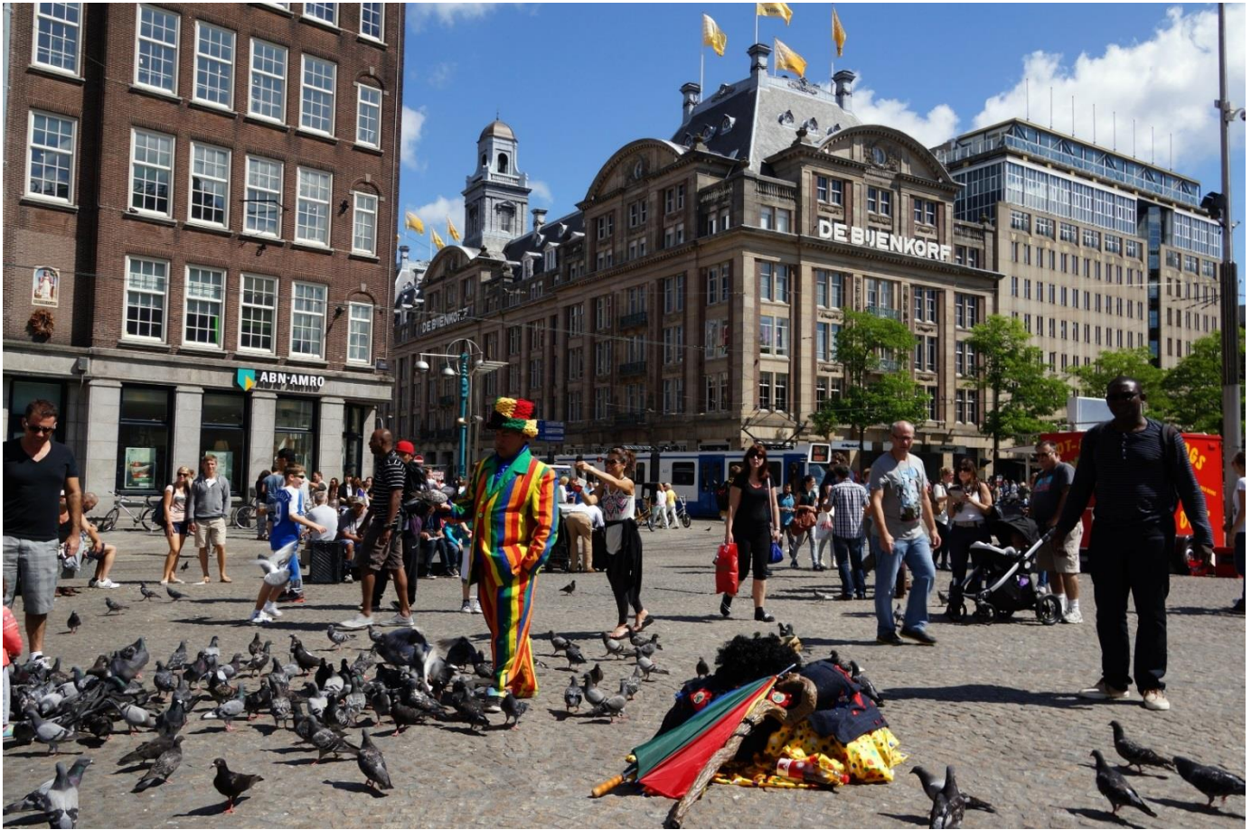
Dam Square is full of busters and pigeons. In the background is a famous department store DeBuekorfs where everything starts at $100.