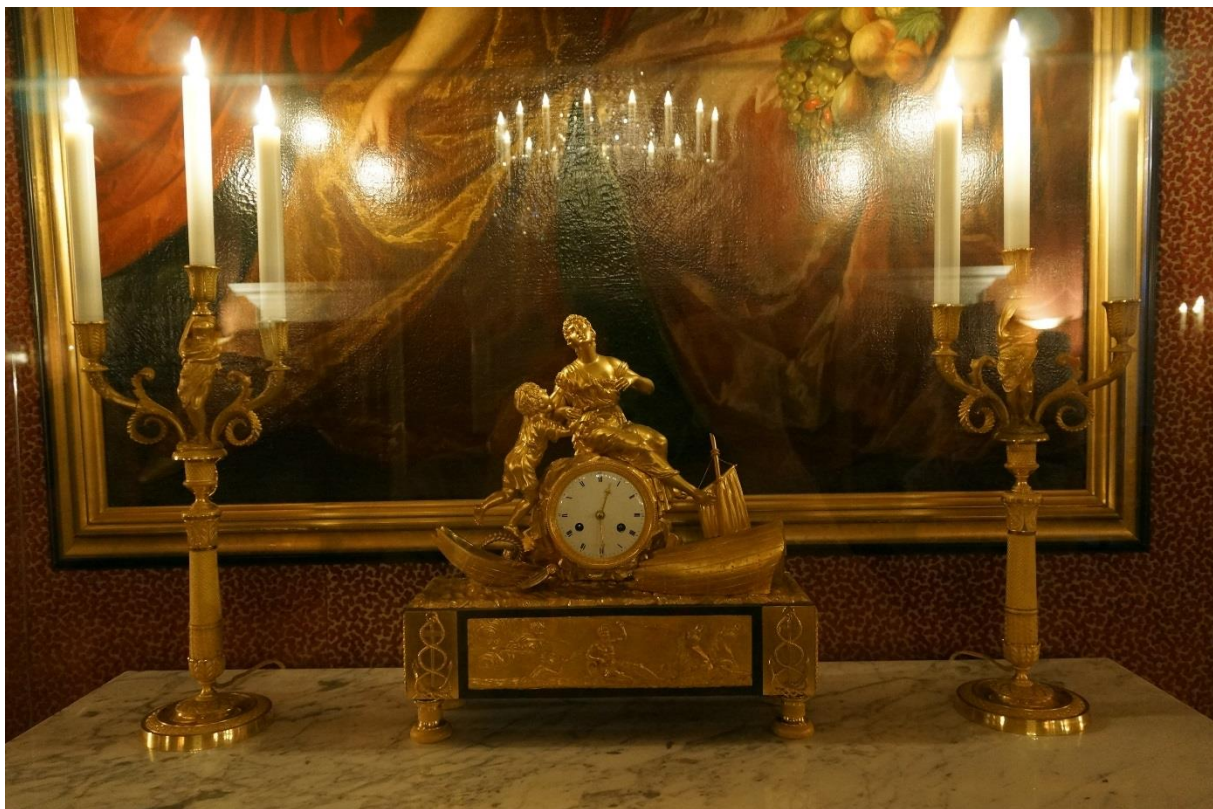
Typical gold plated furnishings in the Palace.