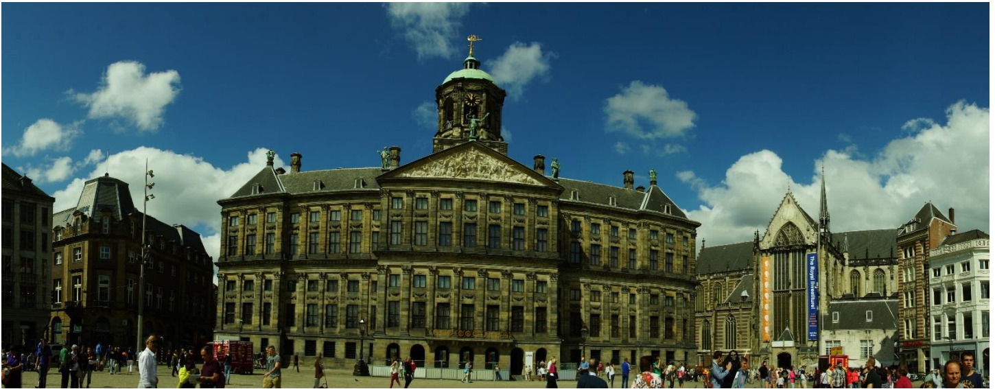
At the other end of Dam Square is the Royal Palace and the “Nieuwe Kirk” or “New Church”.