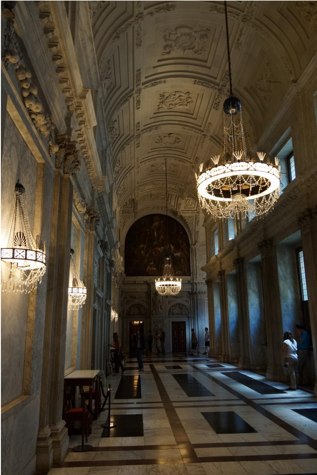
One of two Grand Halls in the Palace.