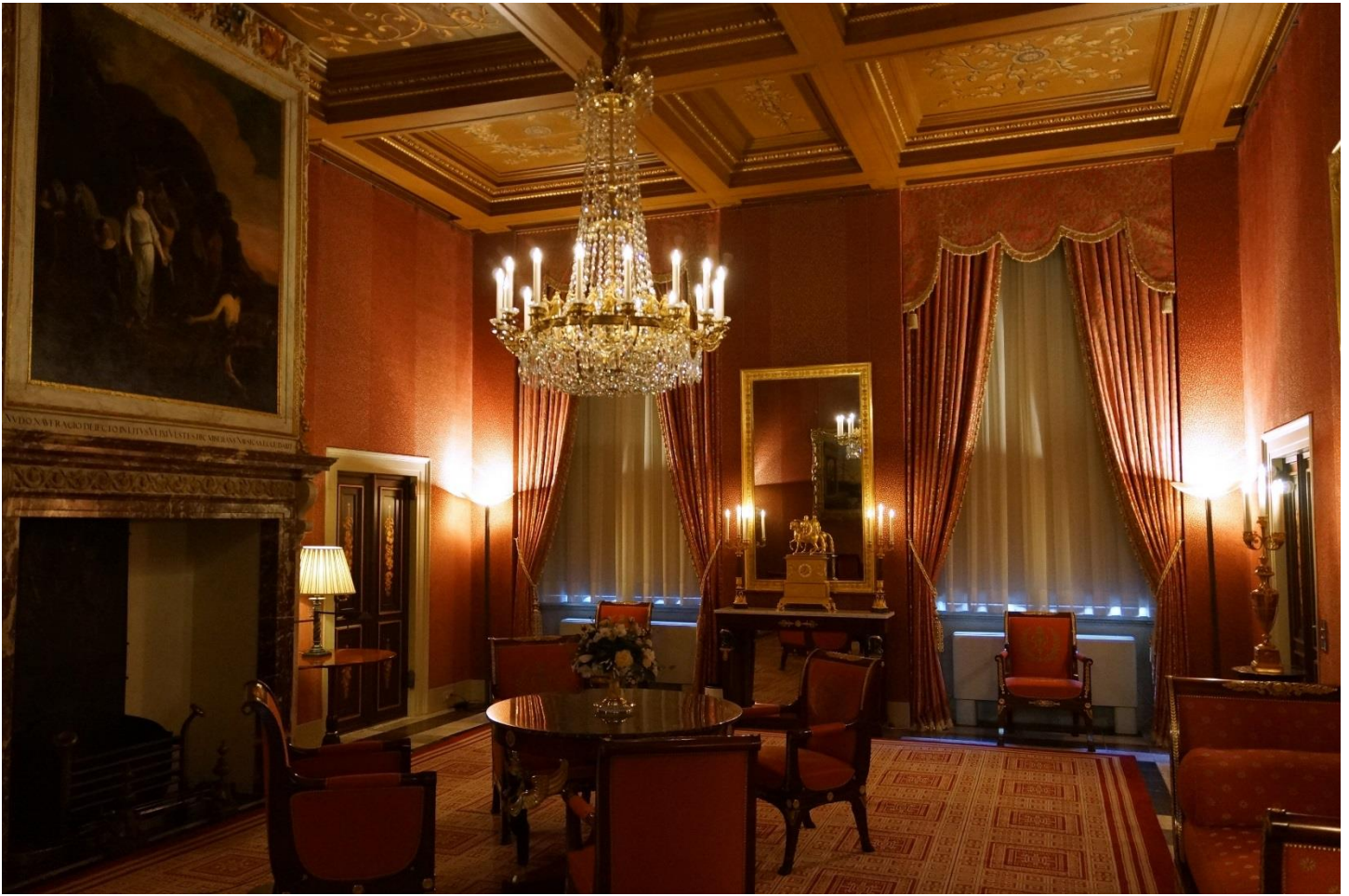
Reception room for meeting heads of state.