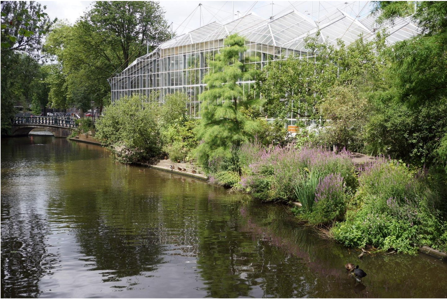
The Amsterdam Botanical Gardens.