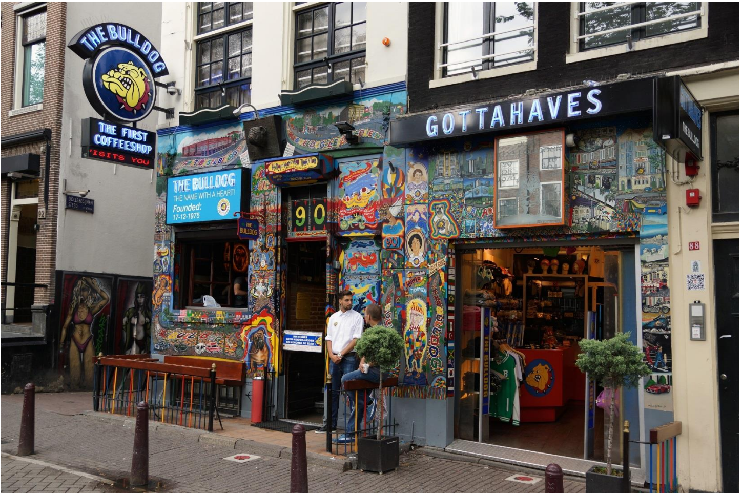
Above: They also are called Coffeshops! They checked ID's to make sure patrons are 18.