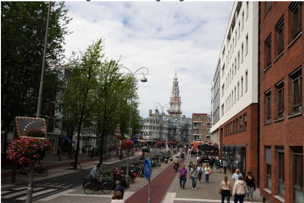
typical street with the bike path, pedestrian walkway and street for cars with flowers.