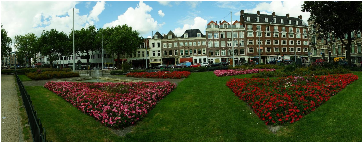
One of the many small parks in the city.