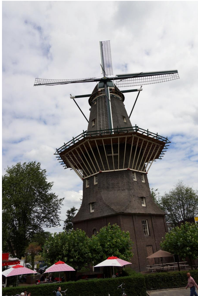
Left: All buildings are required to be covered with netting when construction is underway. This is the decorated netting for this building. Right: One of the famous windmills of the Netherlands. Below: A