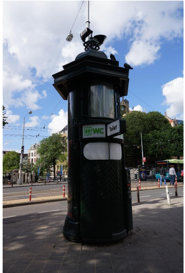
Left it is free, on the right you have to pay!

Below: This canal did not allow houseboats. The Flower Market is on the right side of this canal.