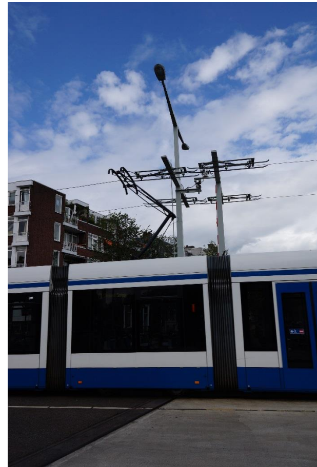
Many of the bridges are too low. Above Top: A boat going through one of the opened bridges. Above: Even the Light Rail's electric line is moved. Right: After going back down a train passes with the electric line back in place.