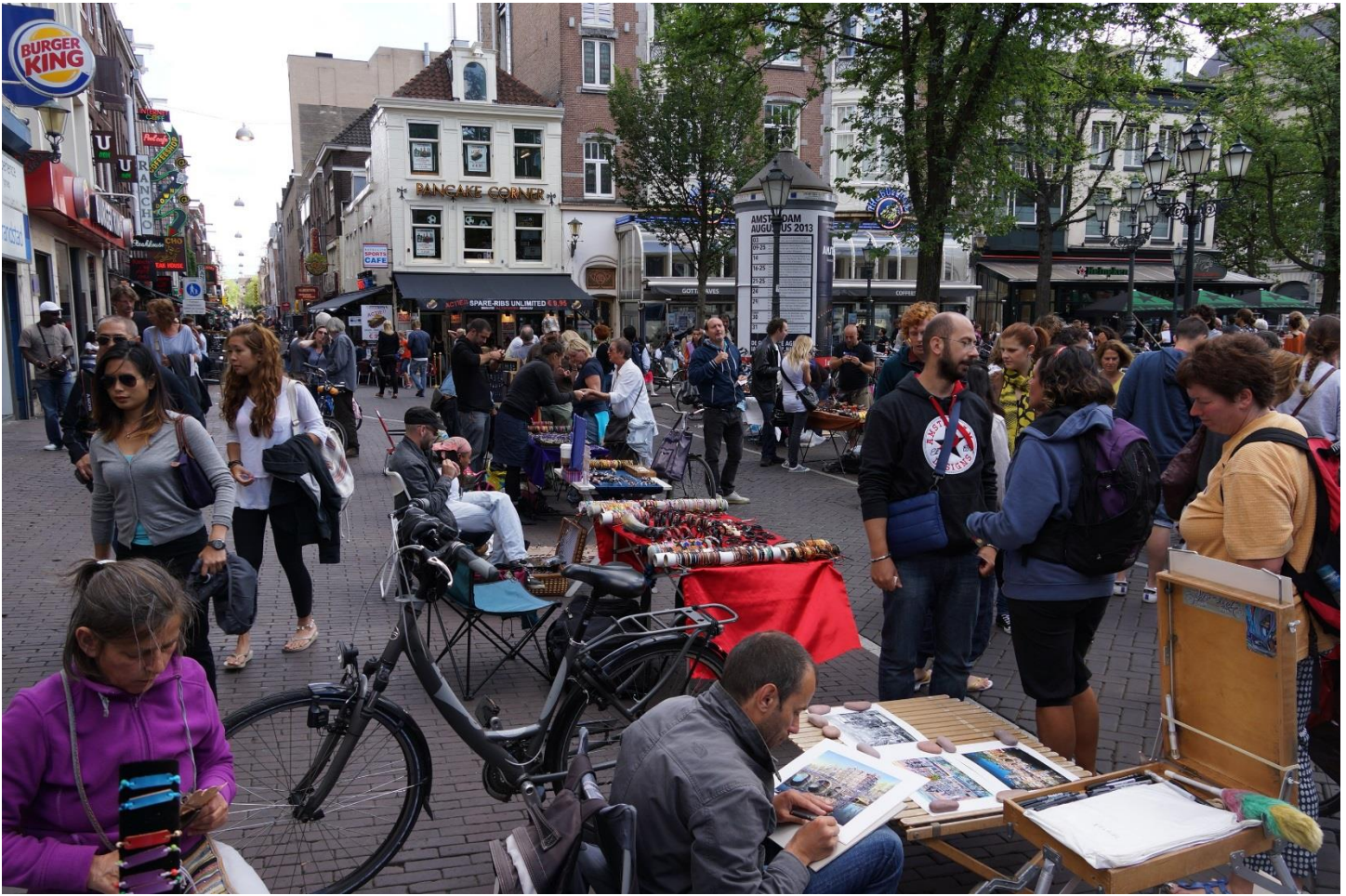
Above: This is the Flea Market. We bought a painting from the artist in the foreground. Below the artist with the print we bought—20 Euros.