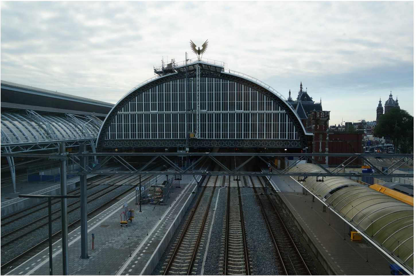
We end the walk with two views from the Ibis Hotel. Above the Central Railroad Station and below the bicycle Parking Lot in front of the hotel.