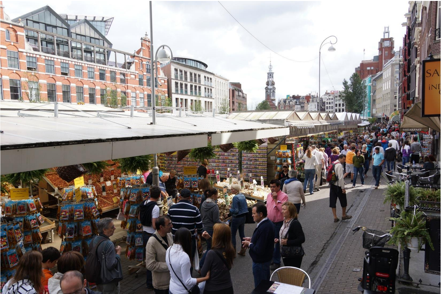
The Flower Market of Amsterdam has many flower shops along the canal.