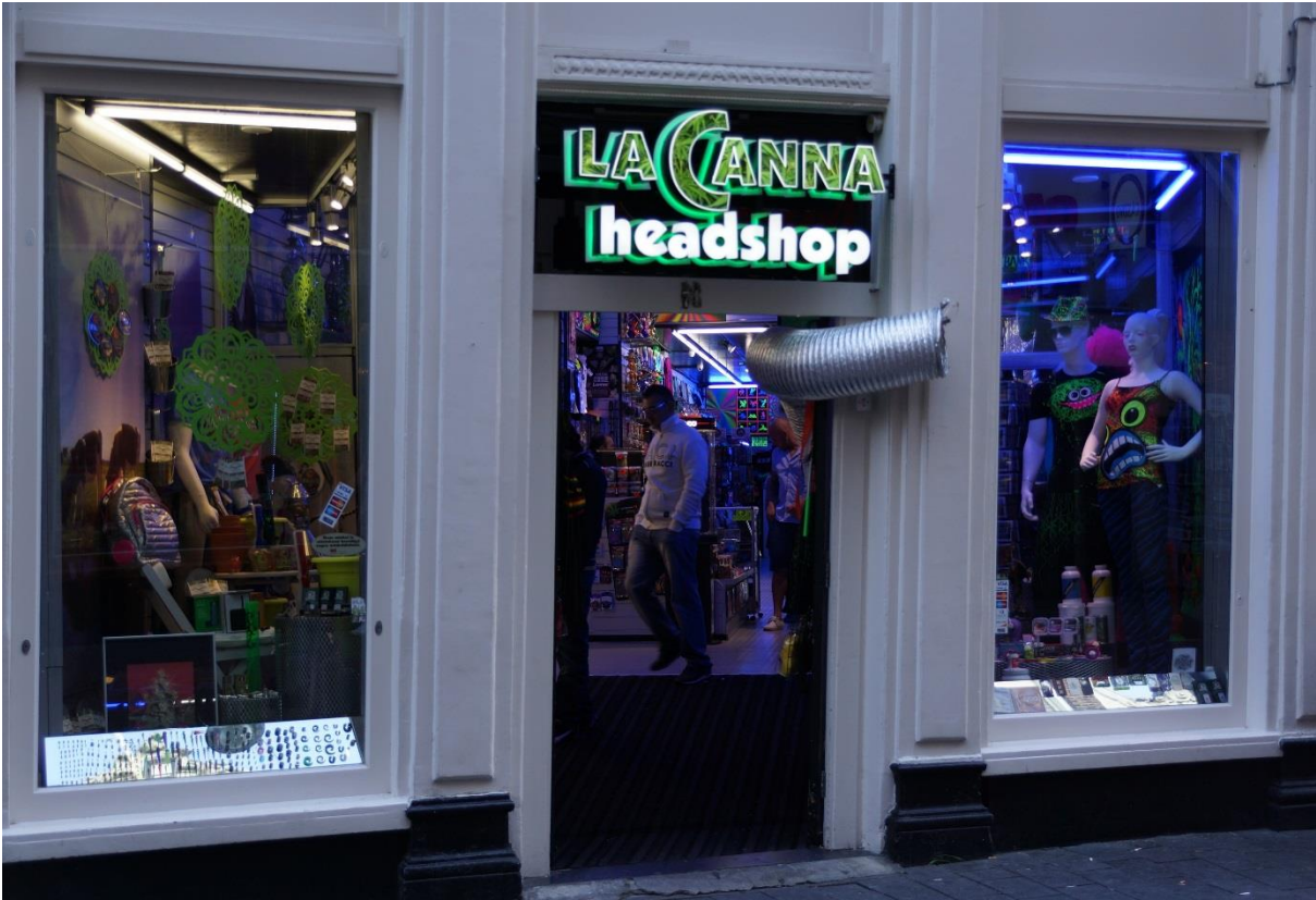
Below: There are many shops for pot paraphernalia.