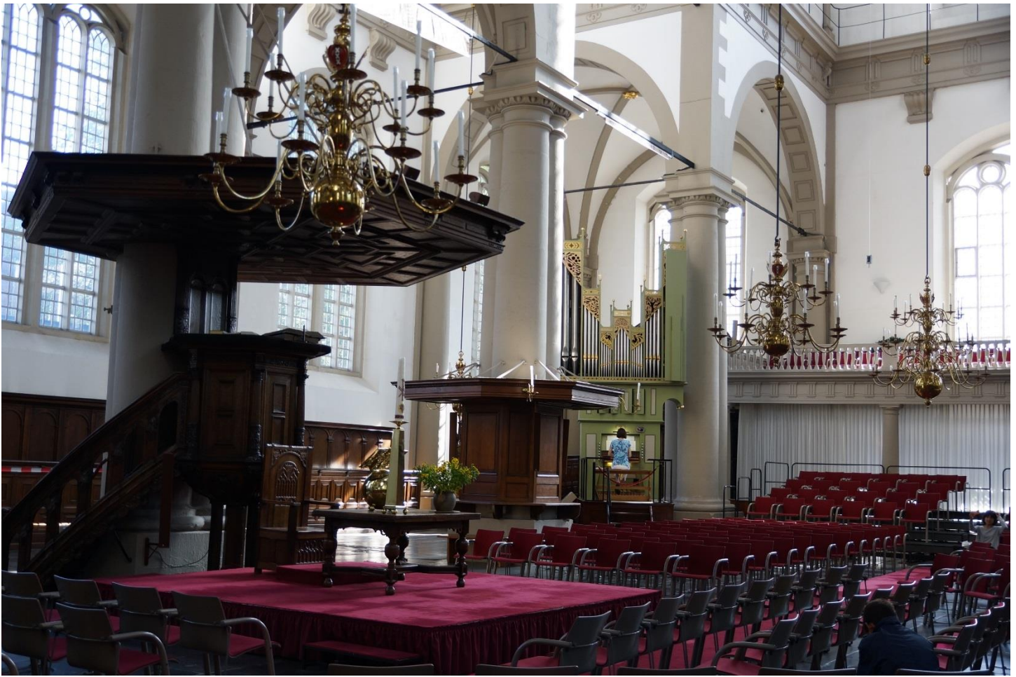
Above: The altar is located in the middle of the church. One of the organs is in a corner to the right. Below: Rembrandt is buried in the church. His burial location was not documented as he died a pauper and his paintings had not yet been discovered.