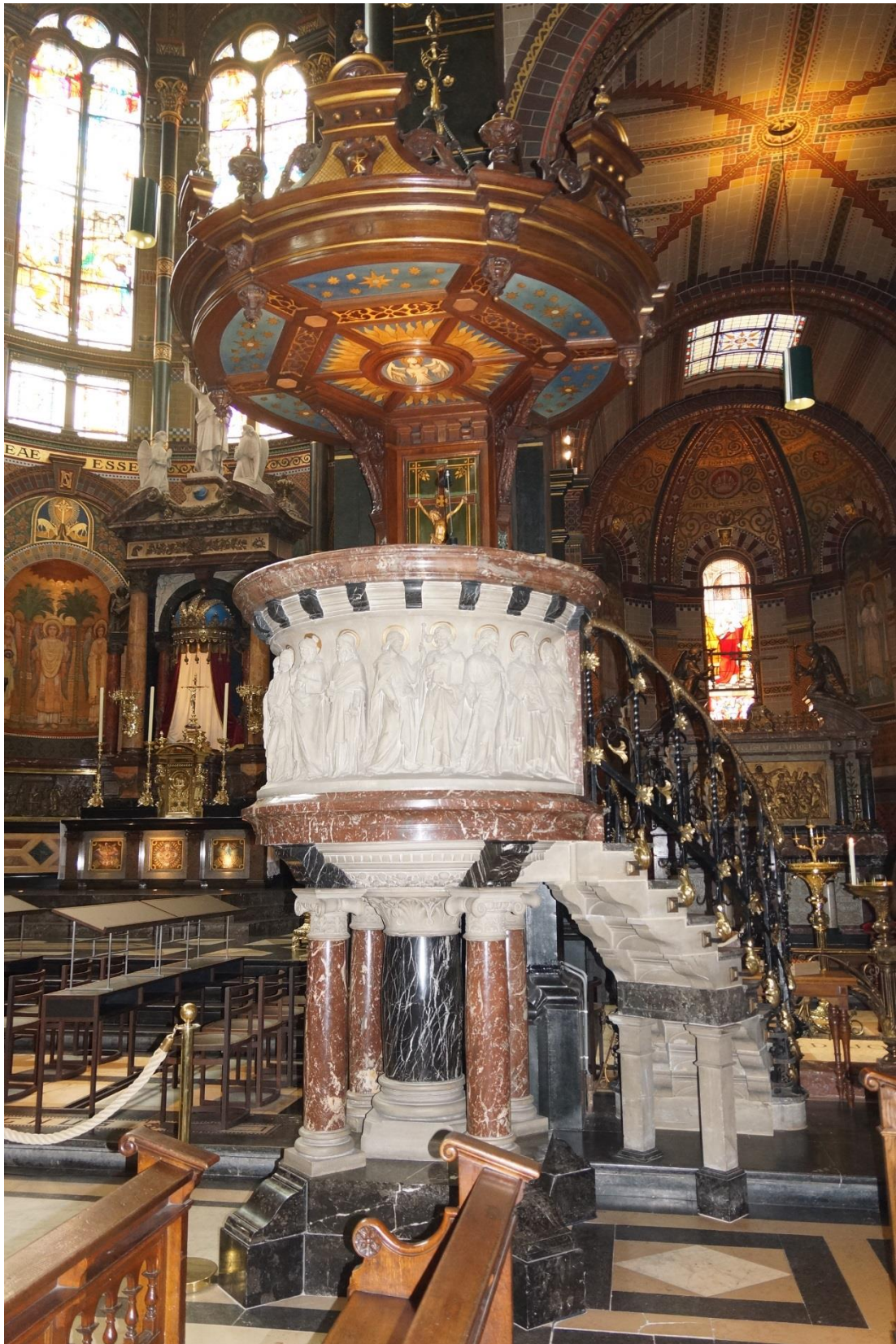
The elaborate Pulpit at The Basilica of St. Nicholas