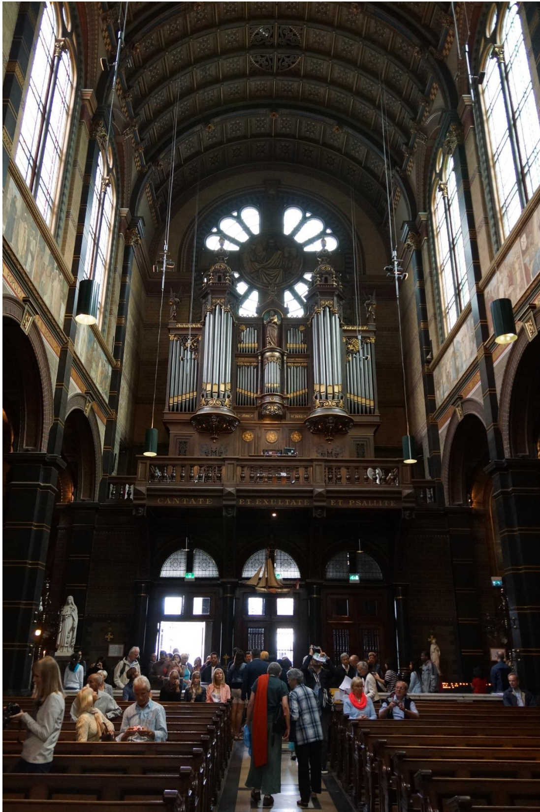
Looking to the back of the church. The organ is a 19 th Century Sauer Organ.