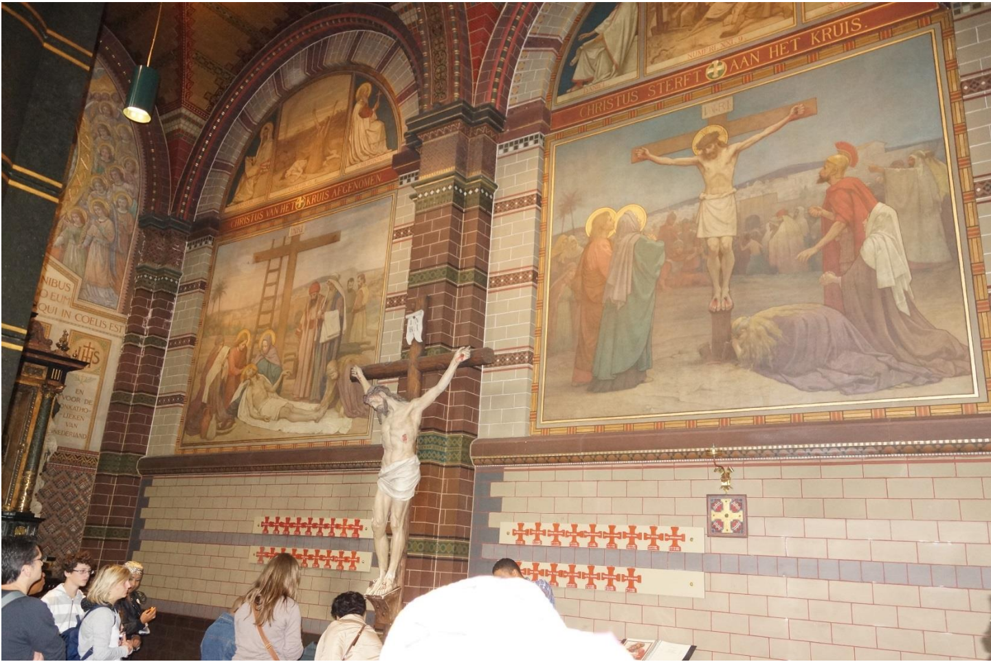
The Stations of the Cross are paintings on the walls.