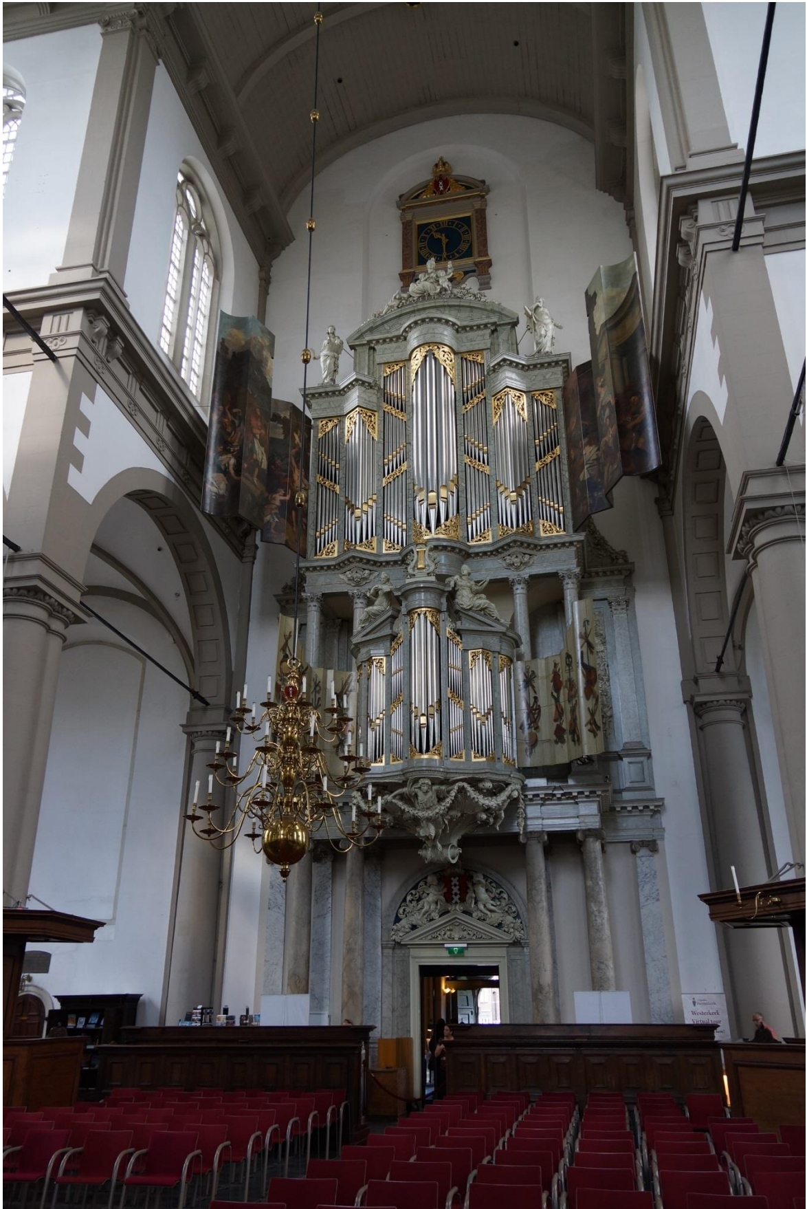
The main organ in the church. The church is used for concerts.