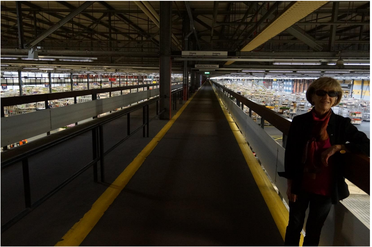
Above: How big is 3 million square feet? It was a long walk to the end.