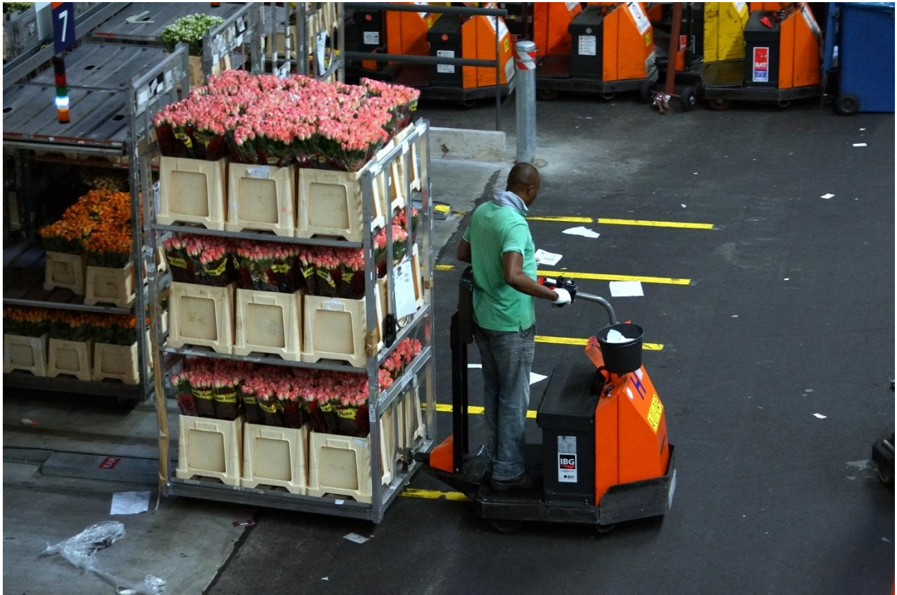
Above: The Flower Cart is attached and the driver is on his way to distribute the pallets.

Below: The center lanes are equivalent to a four lane super highway. It is the driver's route to the distribution point with their Flower Cart full of pallets.