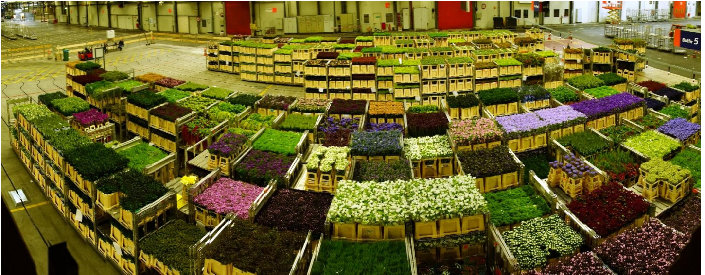
Some buyers are really big. This appears to be two orders for two buyers.