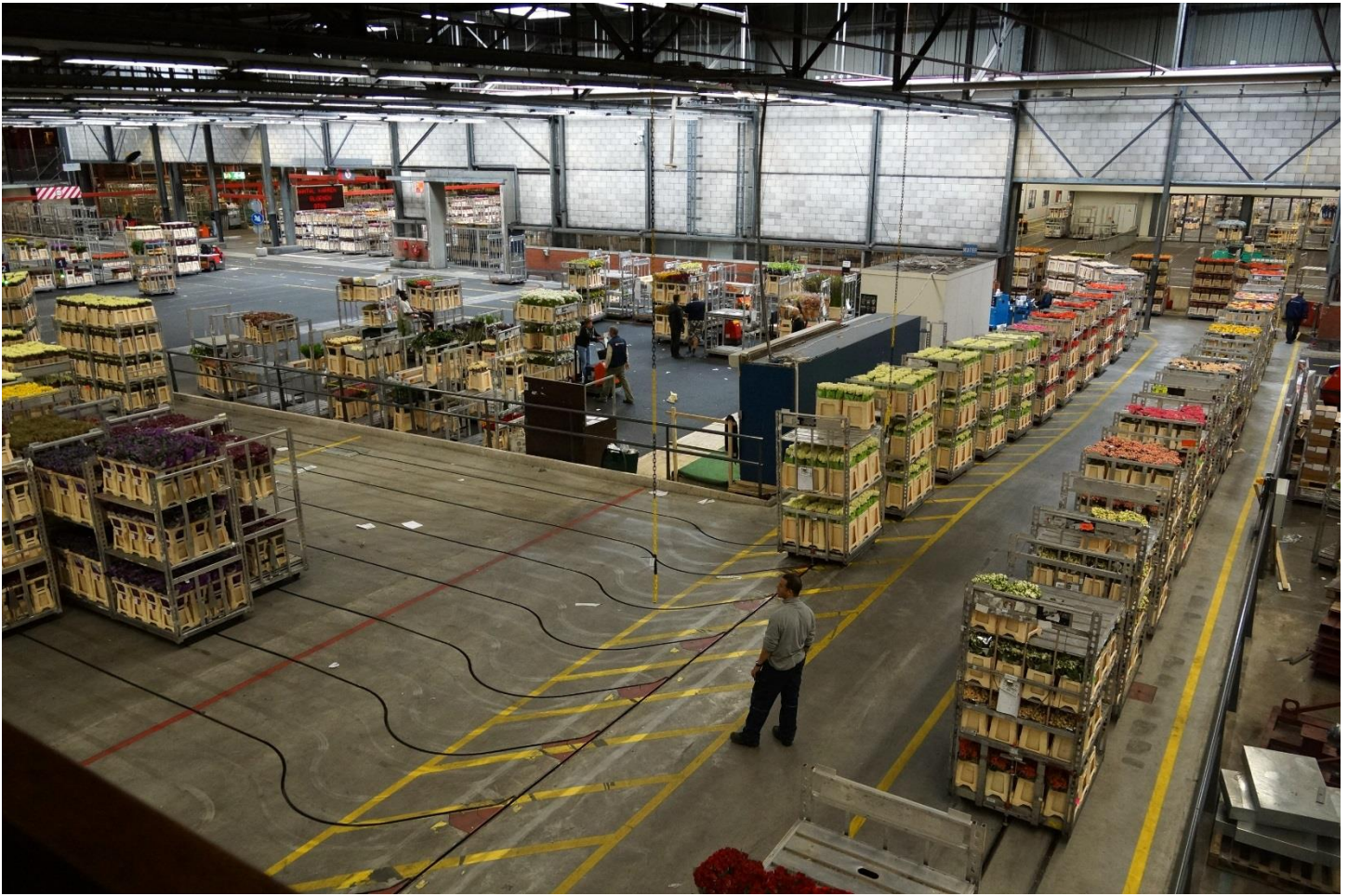
Above: This area is fully automatic. The Flower Carts follow the track which takes them to a shipping area. Below: The main entrance to the Aalsmeer Flower Exchange. See the video.