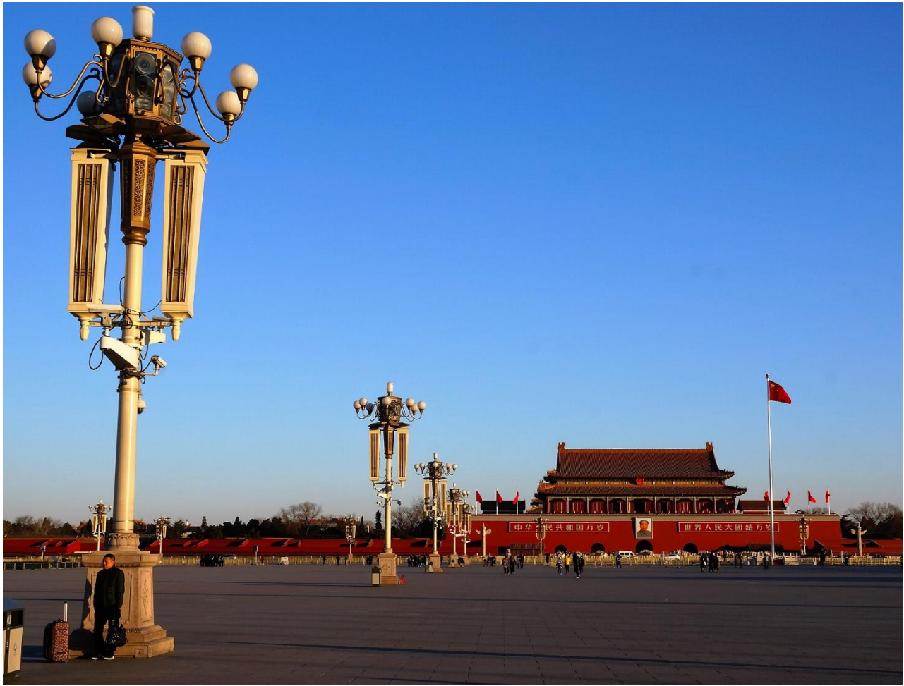
Above: The poles have security cameras. Below: Two frozen tourists.