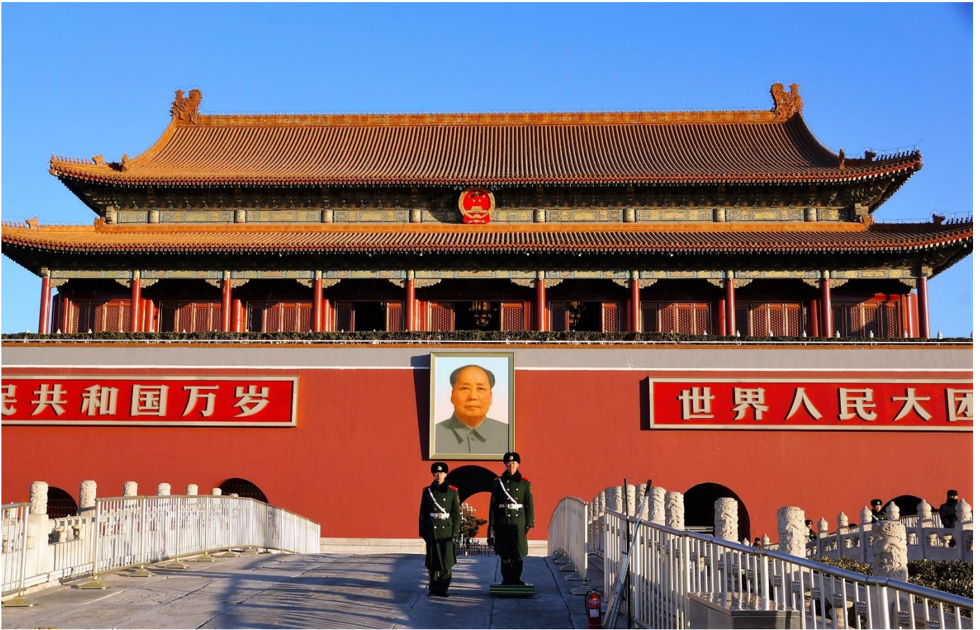
Above: The Tiananmen gate entrance to the Forbidden City from Tiananmen Square. Below: The actual square is 109 acres and much of it is used by the Chairman Mao Memorial.