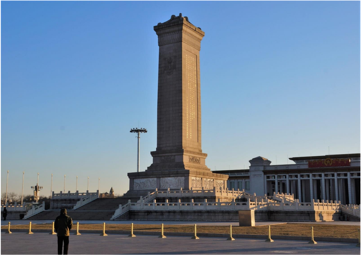
Above: The Monument to Peoples Heroes. The buildings beside the square include the Hall of Congress (below) where the party meets.