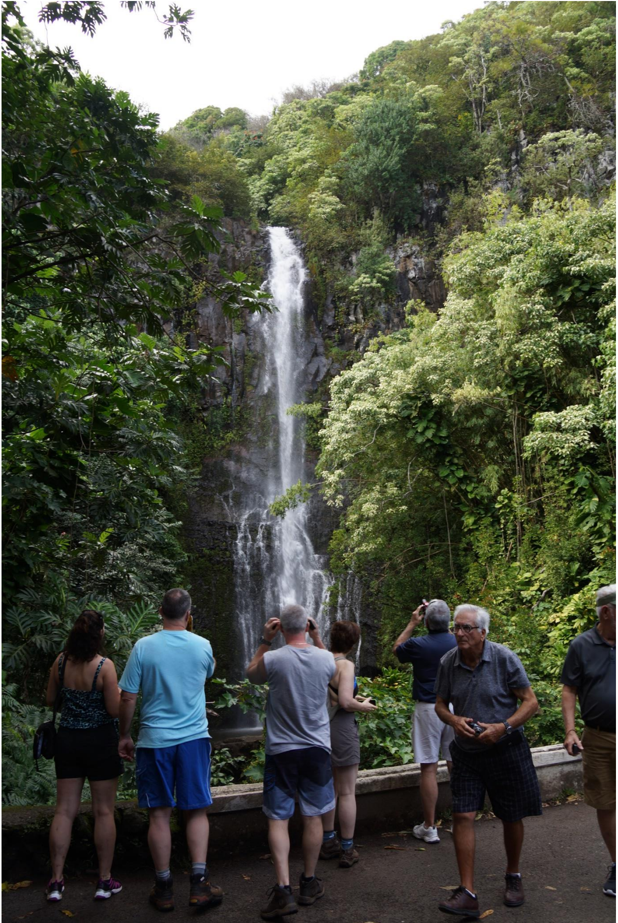
The 80' Wailua Falls near the 7 Sacred Pools.