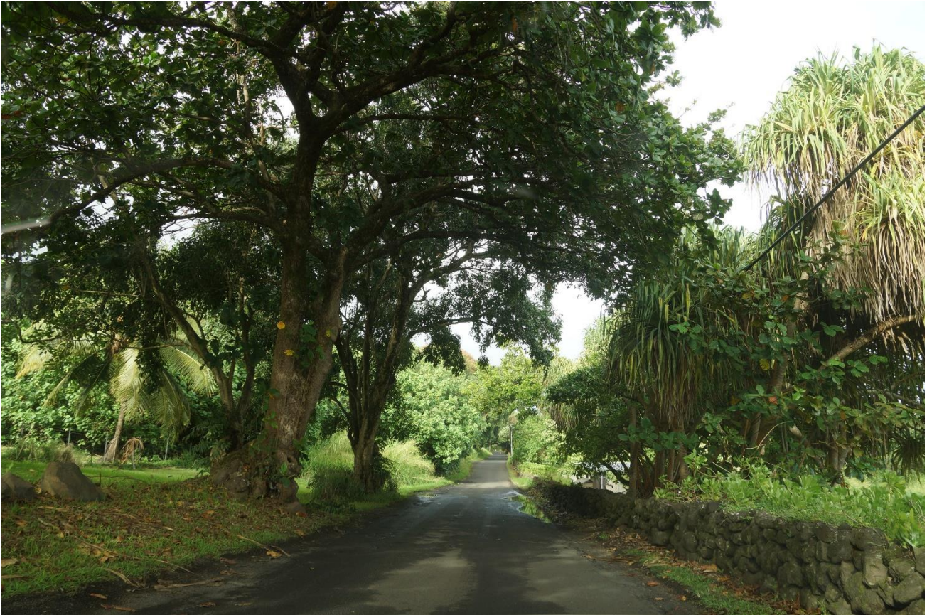
The road to Hana is lined with trees, curvy roads and 54 bridges.