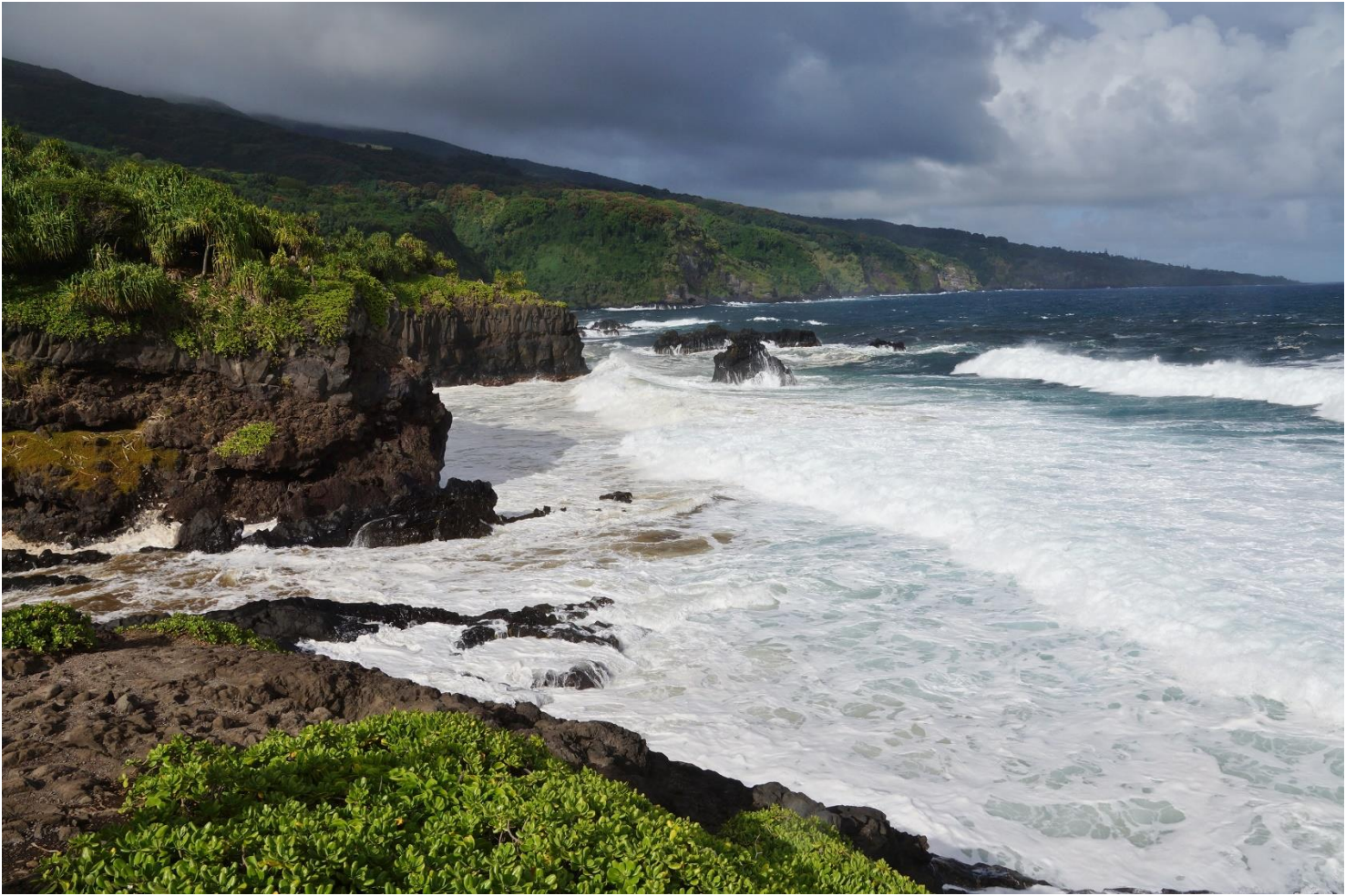
The shoreline along the road to Hana. Below a huge Poinsettia bush in Hana.