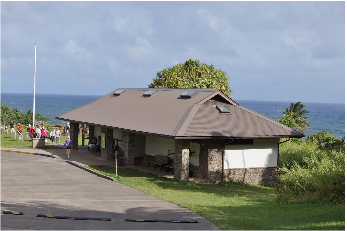
Above: One of 3 rest stops on the road to Hana. Below: Typical tropical vegetation along the road.