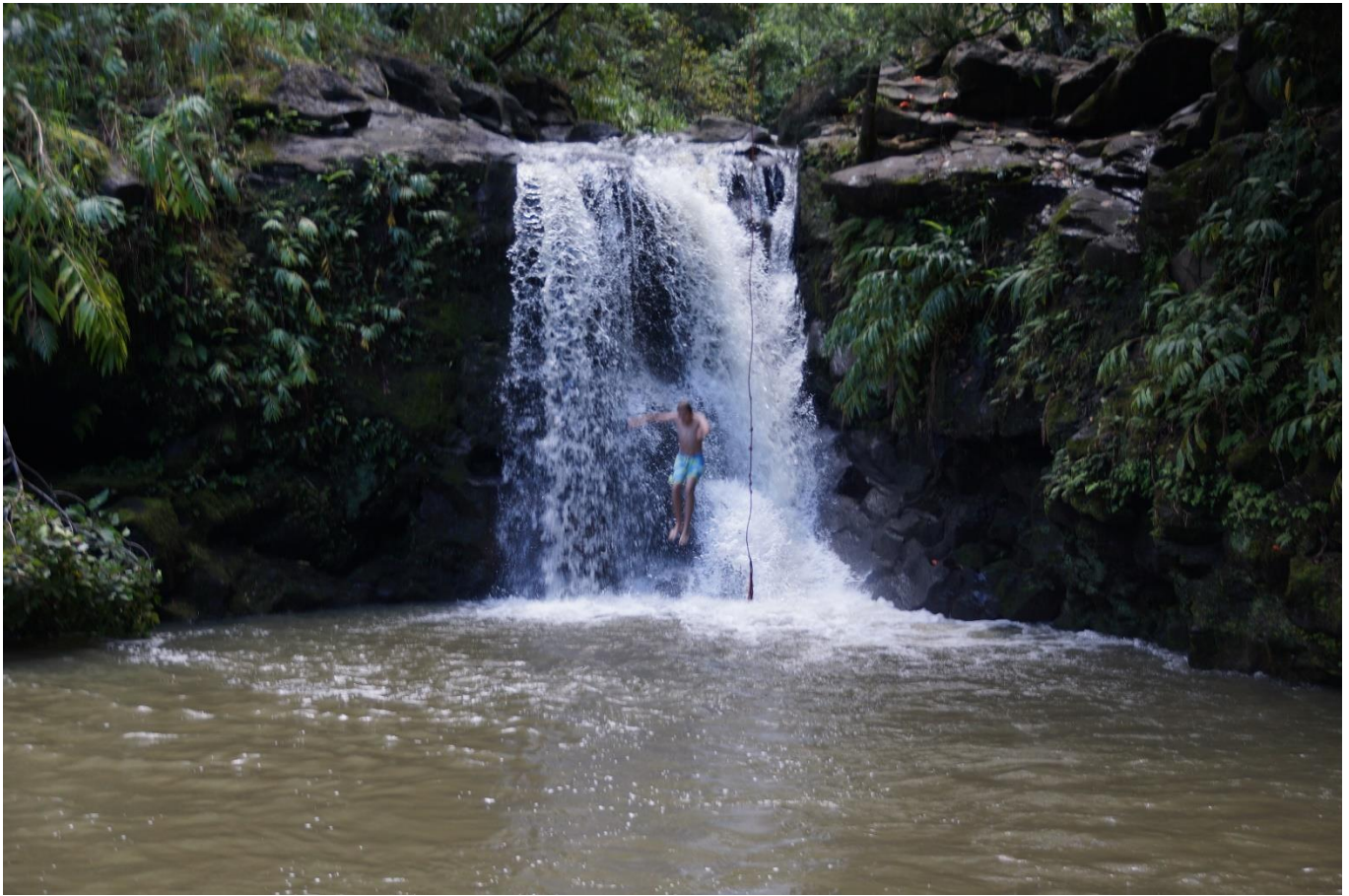
There are dozens of waterfalls along the road to Hana. Some with daredevils.