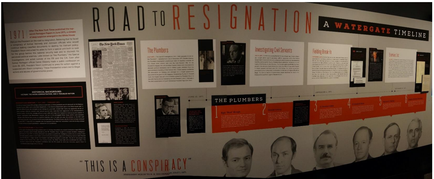
There is also extensive information on Watergate.