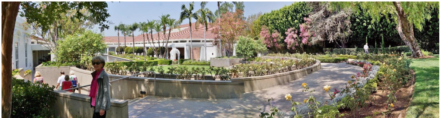
The beautiful grounds around President Nixon's Library and Museum