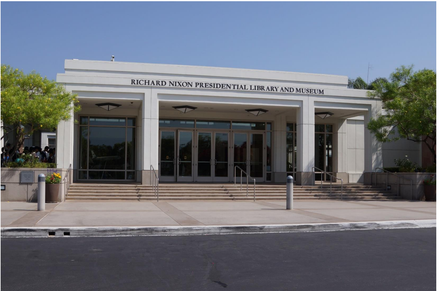
The President Nixon Library and Museum