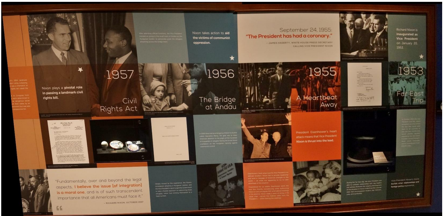
President Nixon's political career is displayed from the beginning in 1946.