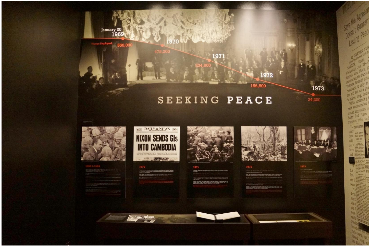
About a third is devoted to Vietnam and China.