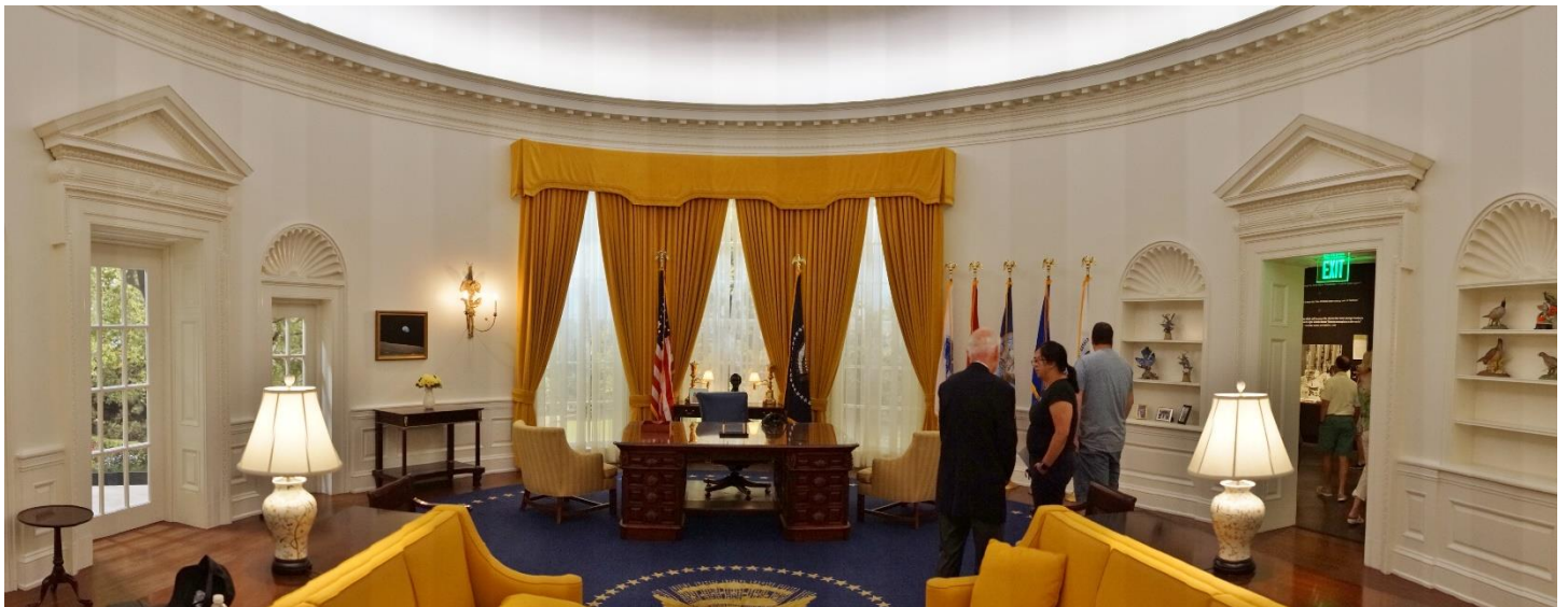
About a third is dedicated to family and White House activities. This is the Oval Office.