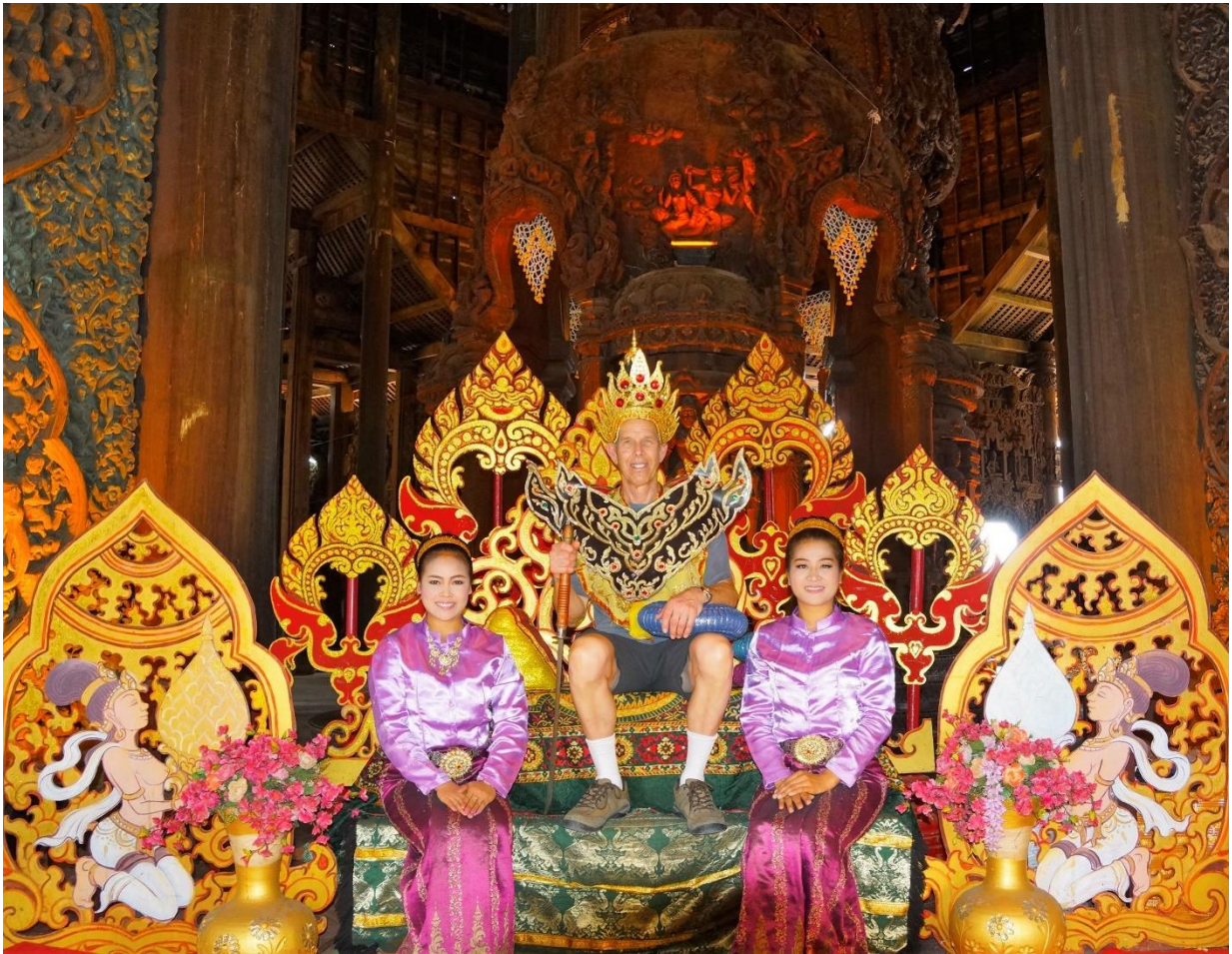
Being King of Siam for a moment.