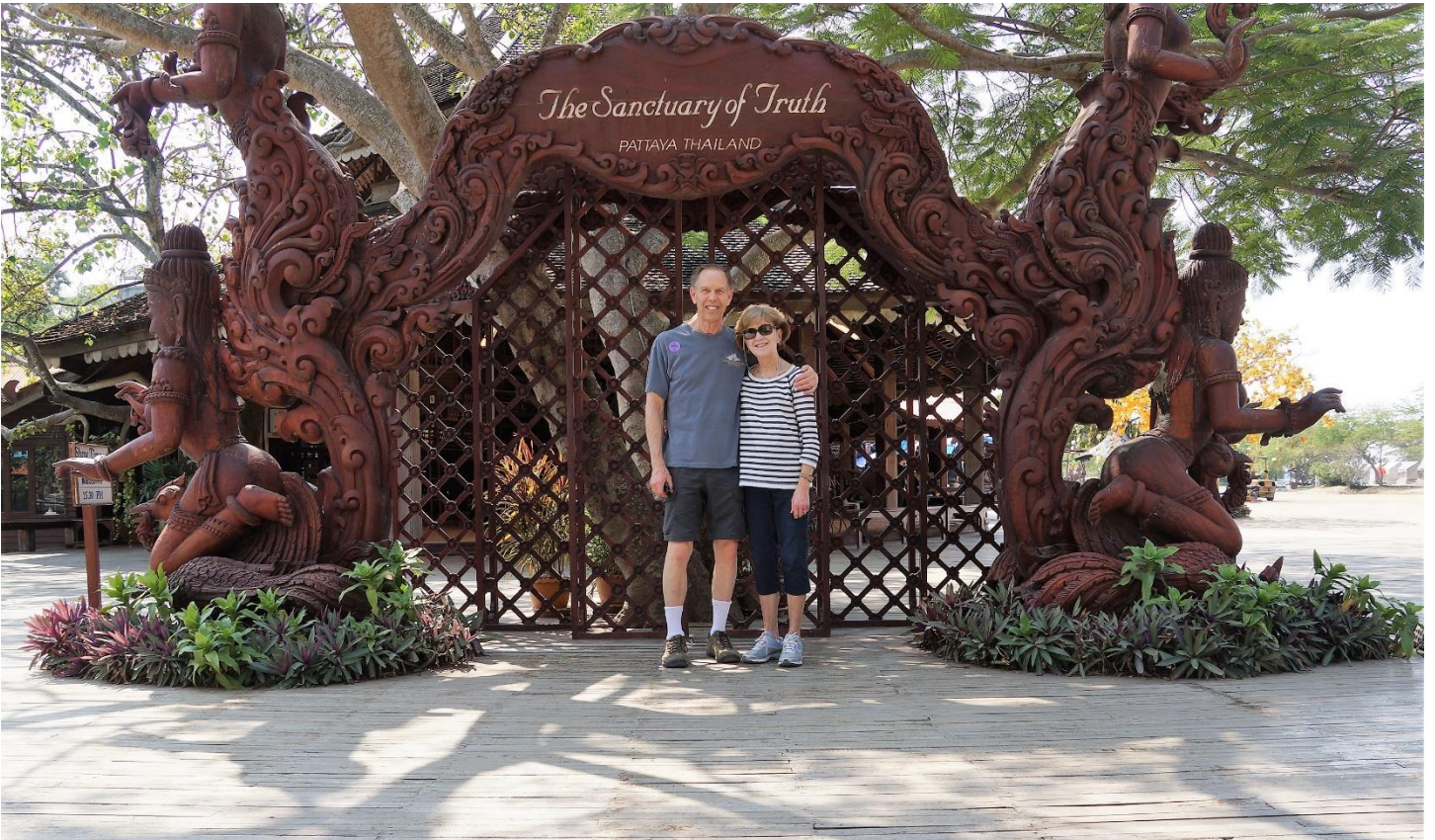
The Sanctuary of Truth is temple dedicated to life. It is totally of wood and all hand carved.