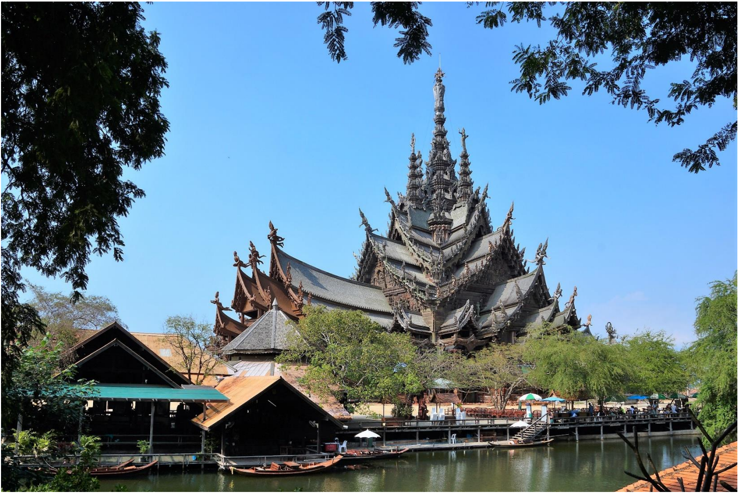
On the way back we pass a tribute to the real King of Siam.