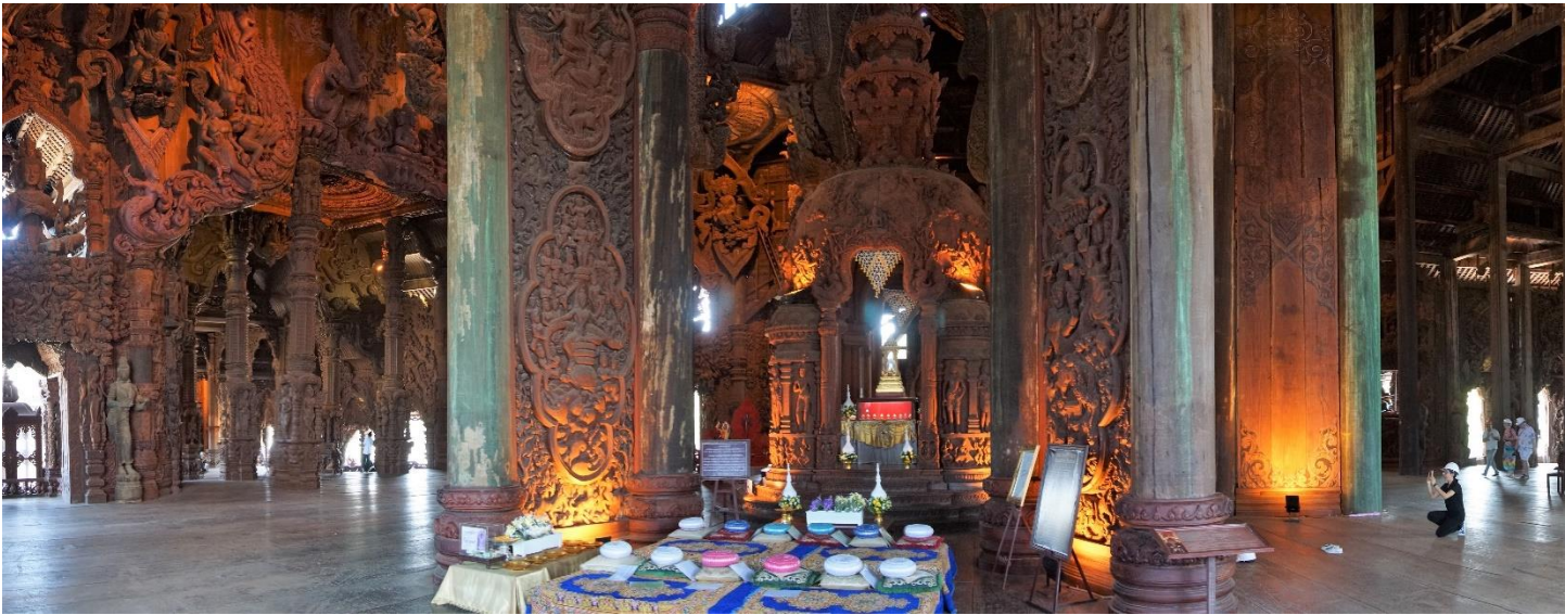
The inside is immense with many intricate carvings.