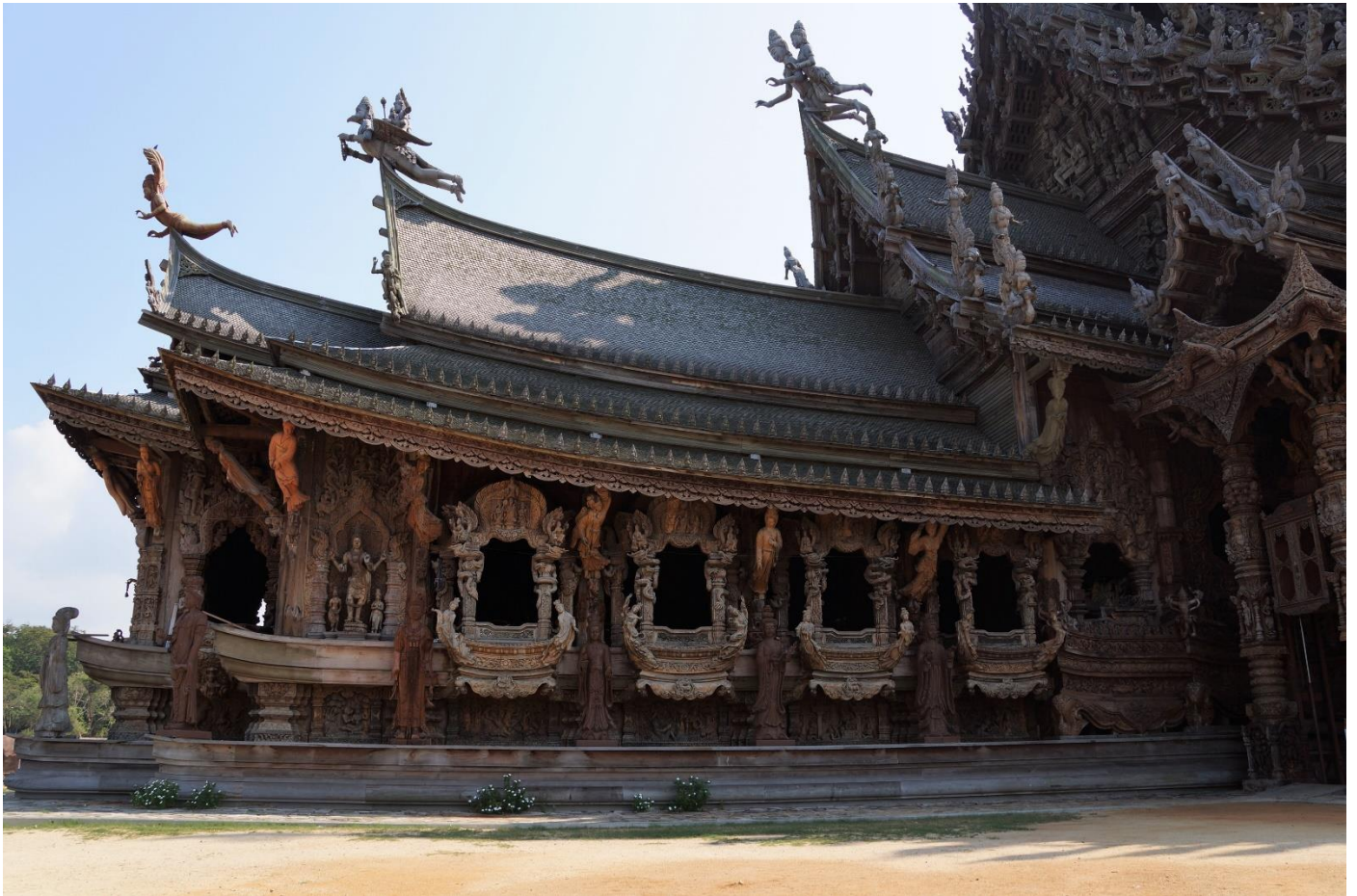
The structure has 250 woodcarvers working full time to complete the temple.