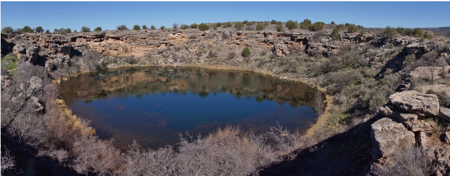
Ten miles away they had a permanent water supply for their crops. The water is not potable. This is called Montezuma's Well. It has a permanent water flow of 1.5 million gallons a day (below).