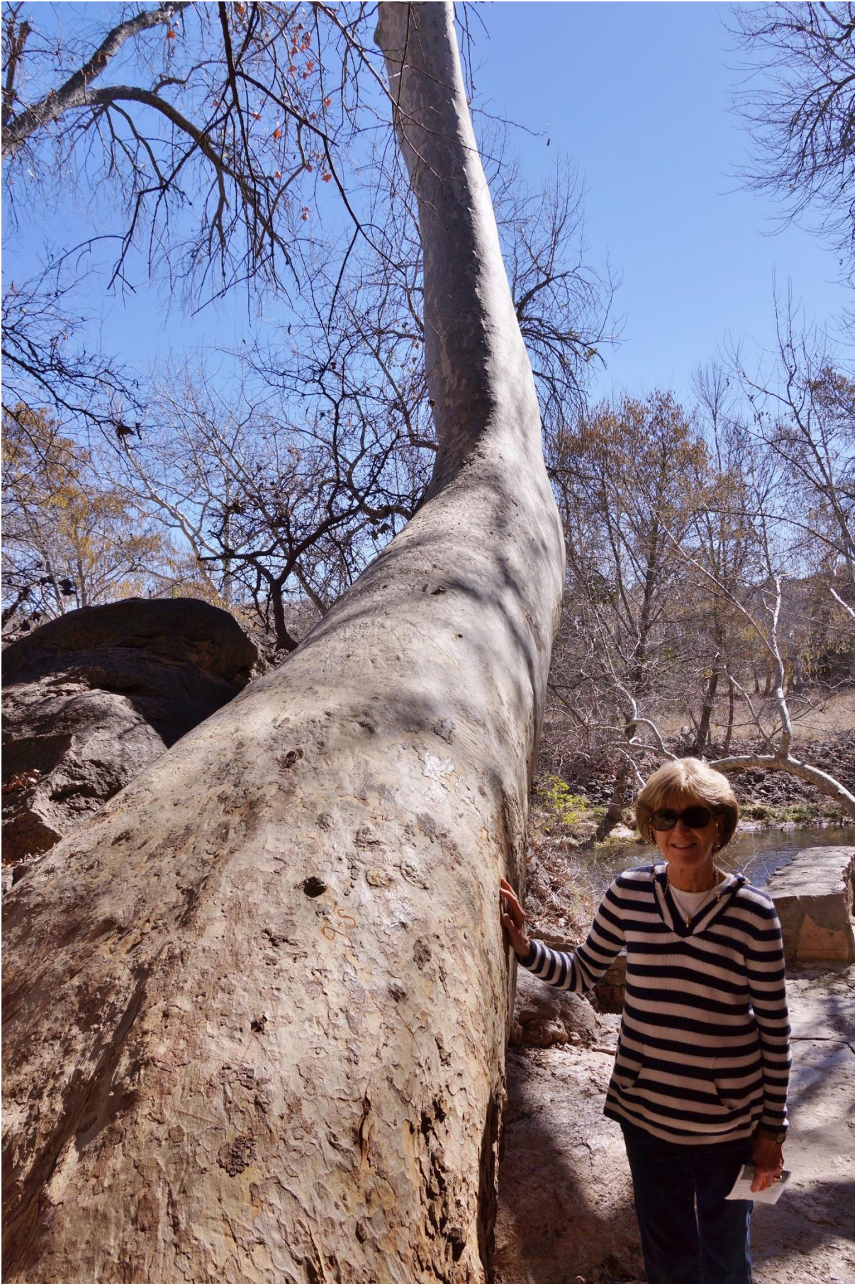
Joanne admires an immense Sycamore tree that gets its water supply from the well drainage.