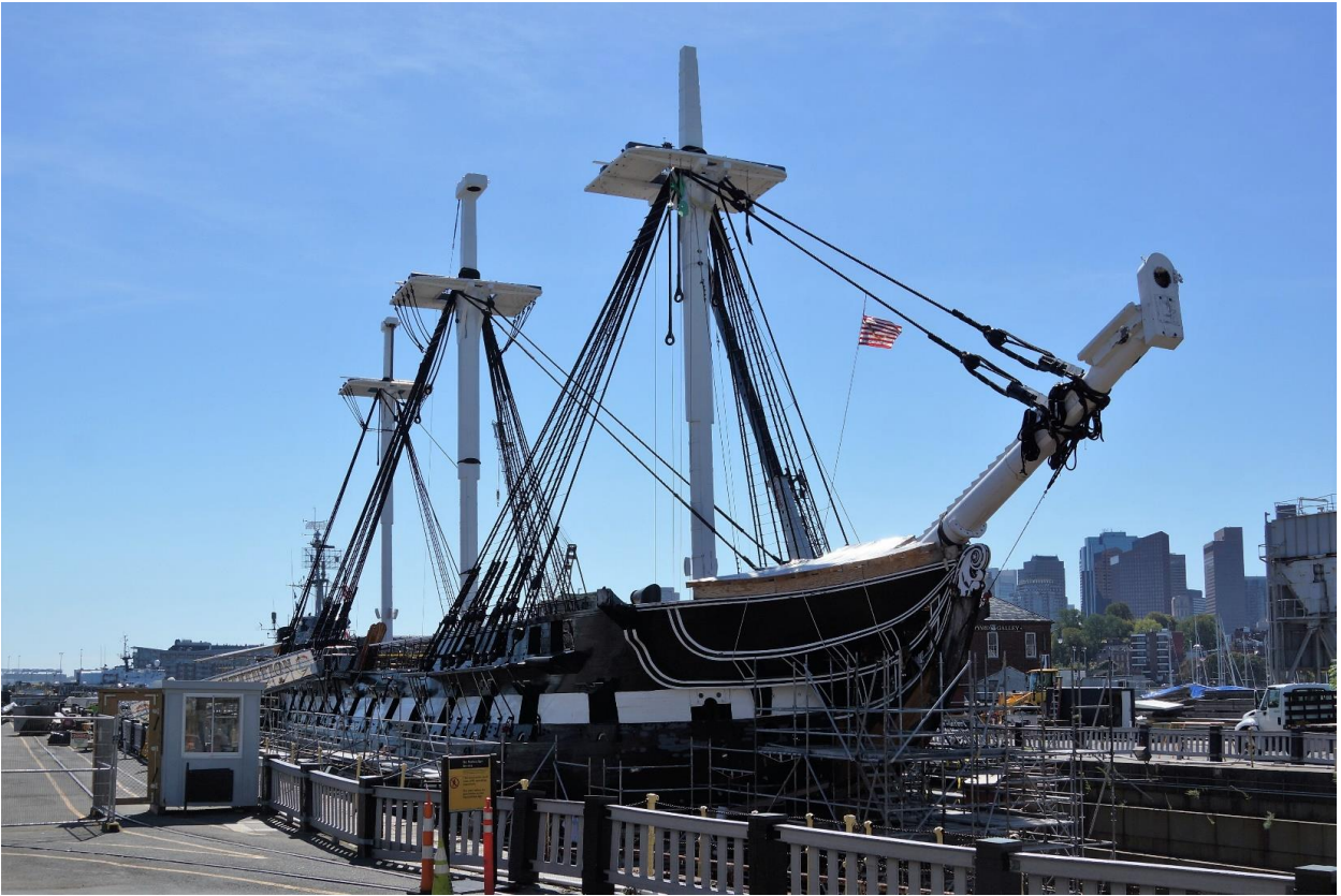
The USS Constitution. One of 5 ships built in 1797 for the first US navy.