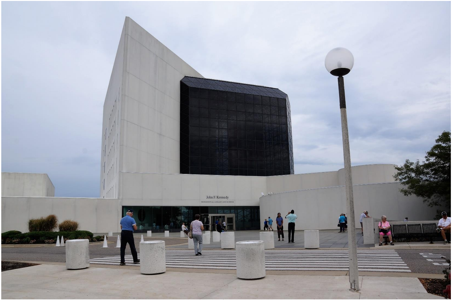
The John F. Kennedy Presidential Library located in Boston.