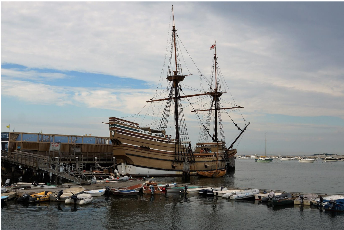
The Pilgrim ship Mayflower in Plymouth. A monument to people seeking freedom to worship as they wished, and the tremendous struggles they had to overcome.