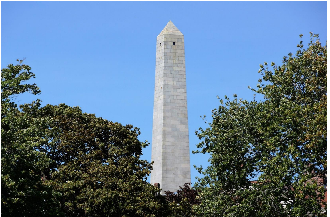
The Monument to the Battle of Bunker Hill on June 17, 1775.