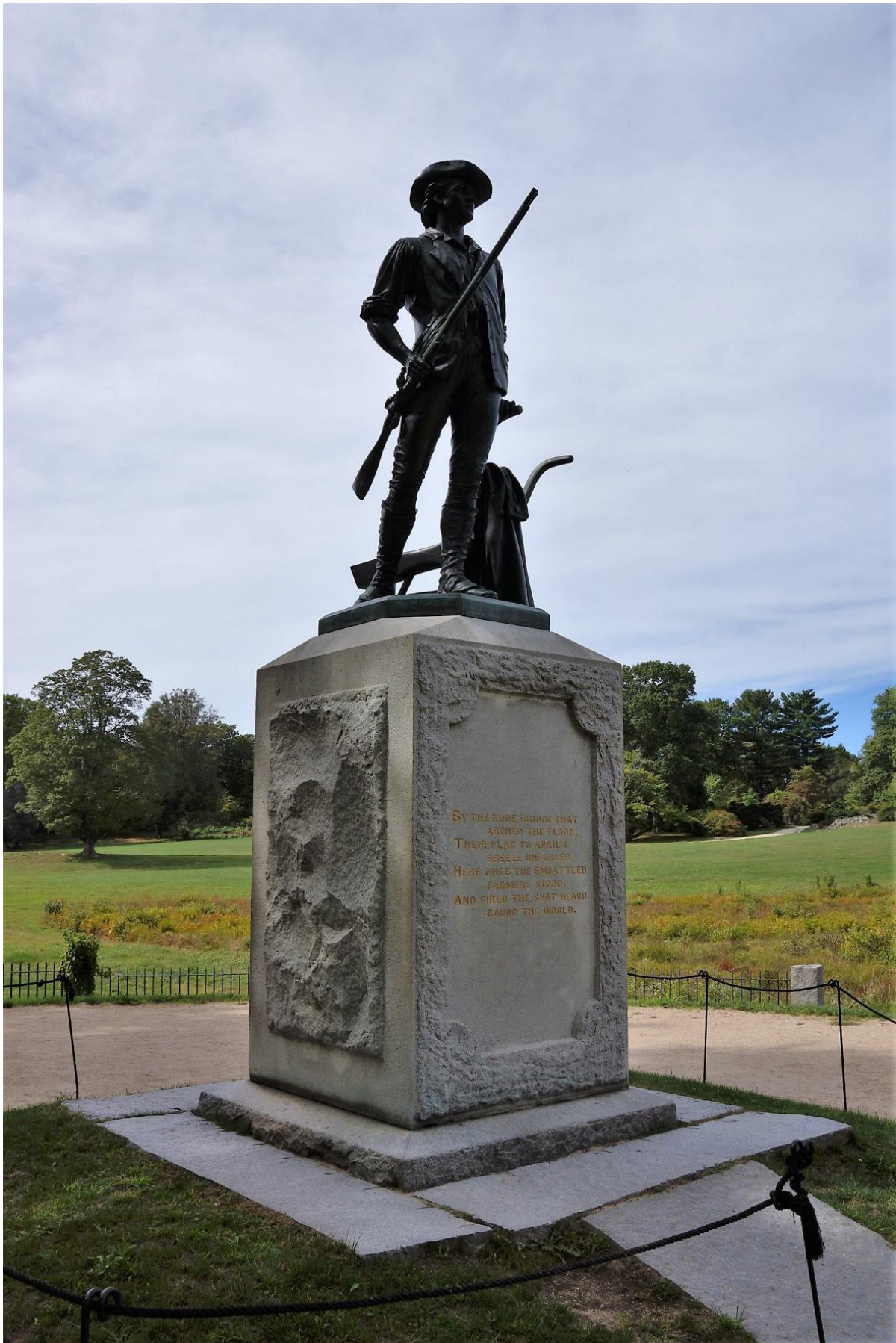
Monument to the Minutemen who were the first line of defense in the Revolutionary War for Independence of the United States.