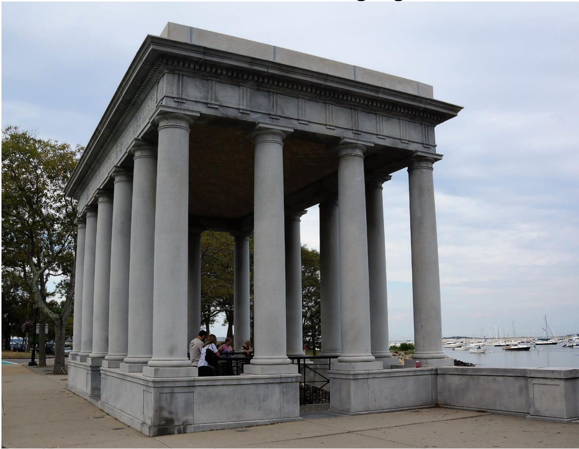
The Monument to the Pilgrims landing in 1620.