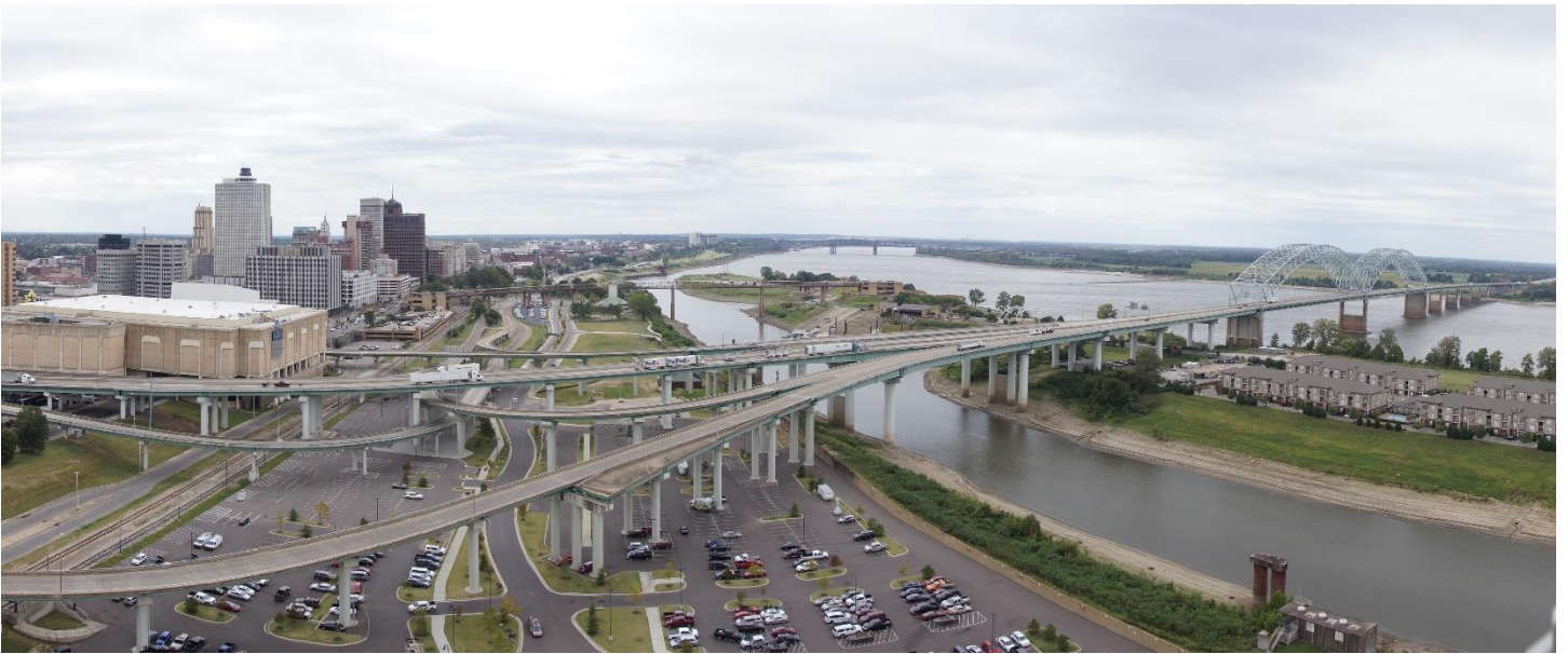
Memphis skyline from the Bass Pro Shop pyramid building.