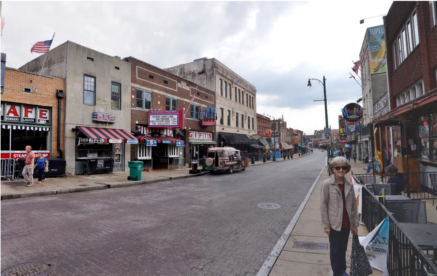
Beale Street, the Blues and BBQ center of Memphis.