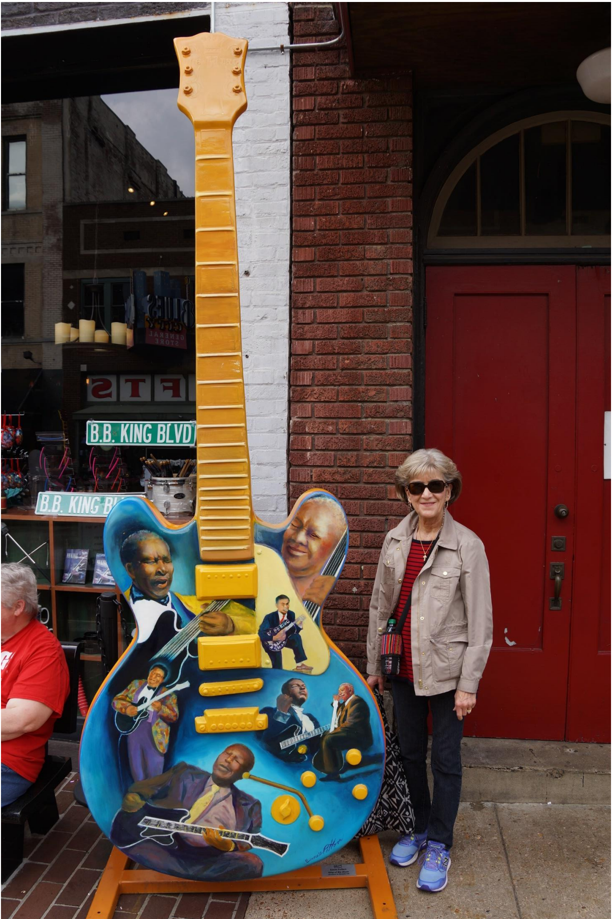
B. B. King of blues fame is popular here.