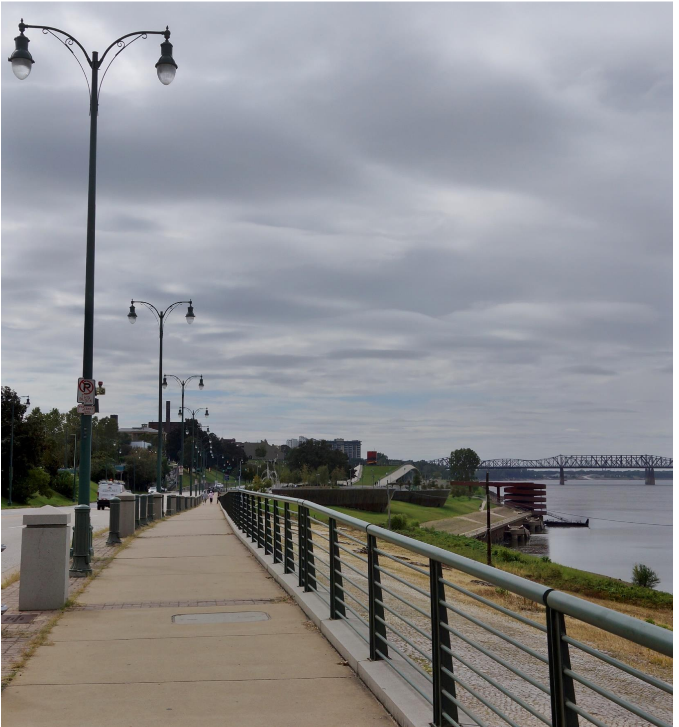
Walkway along the Mississippi River.