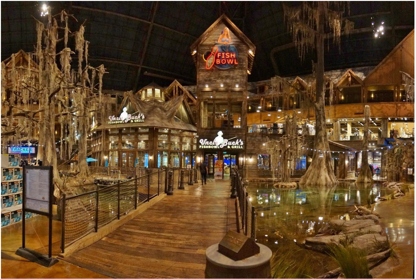
Inside Bass Pro Shop pyramid.