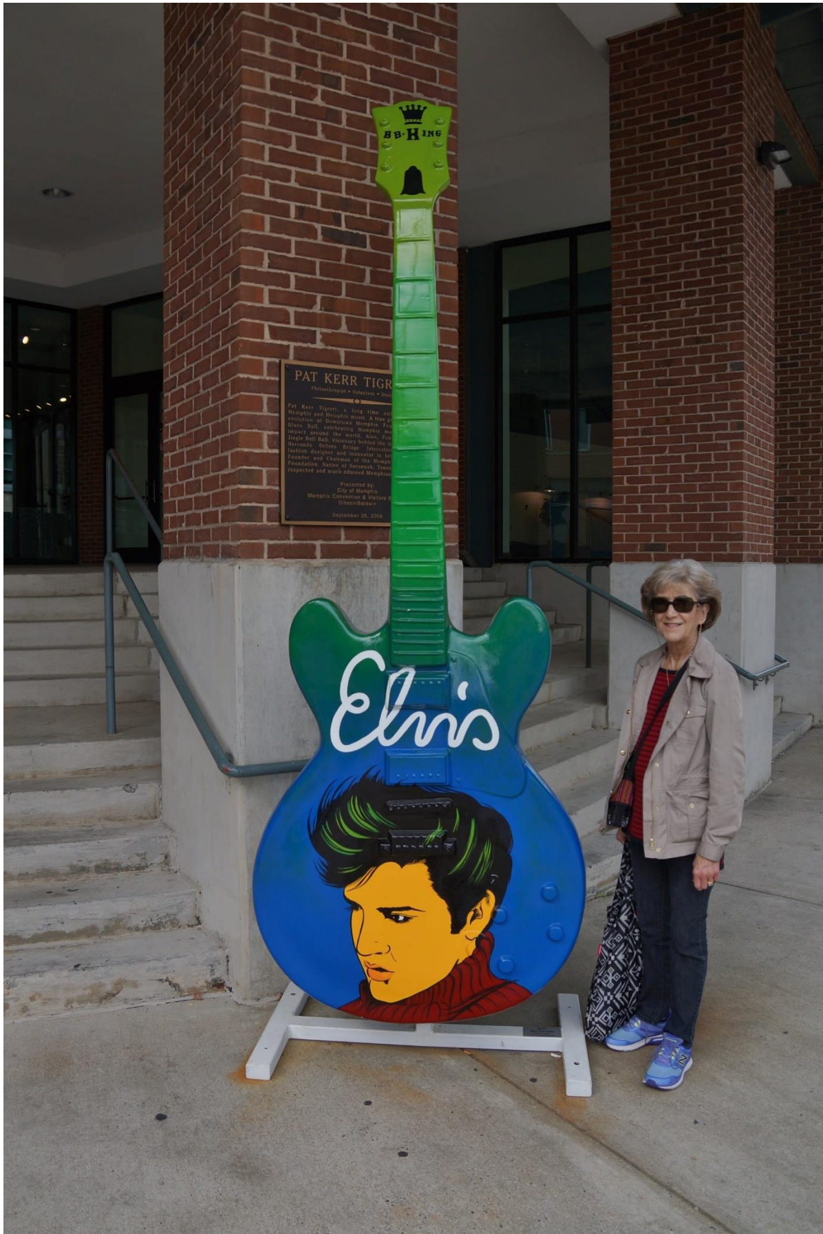
Memphis is Elvis's hometown. He is very popular here.