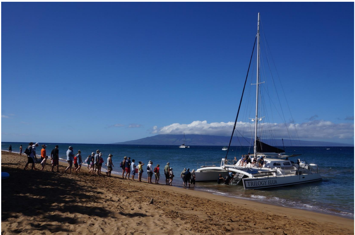
Below: Tourists go sailing.