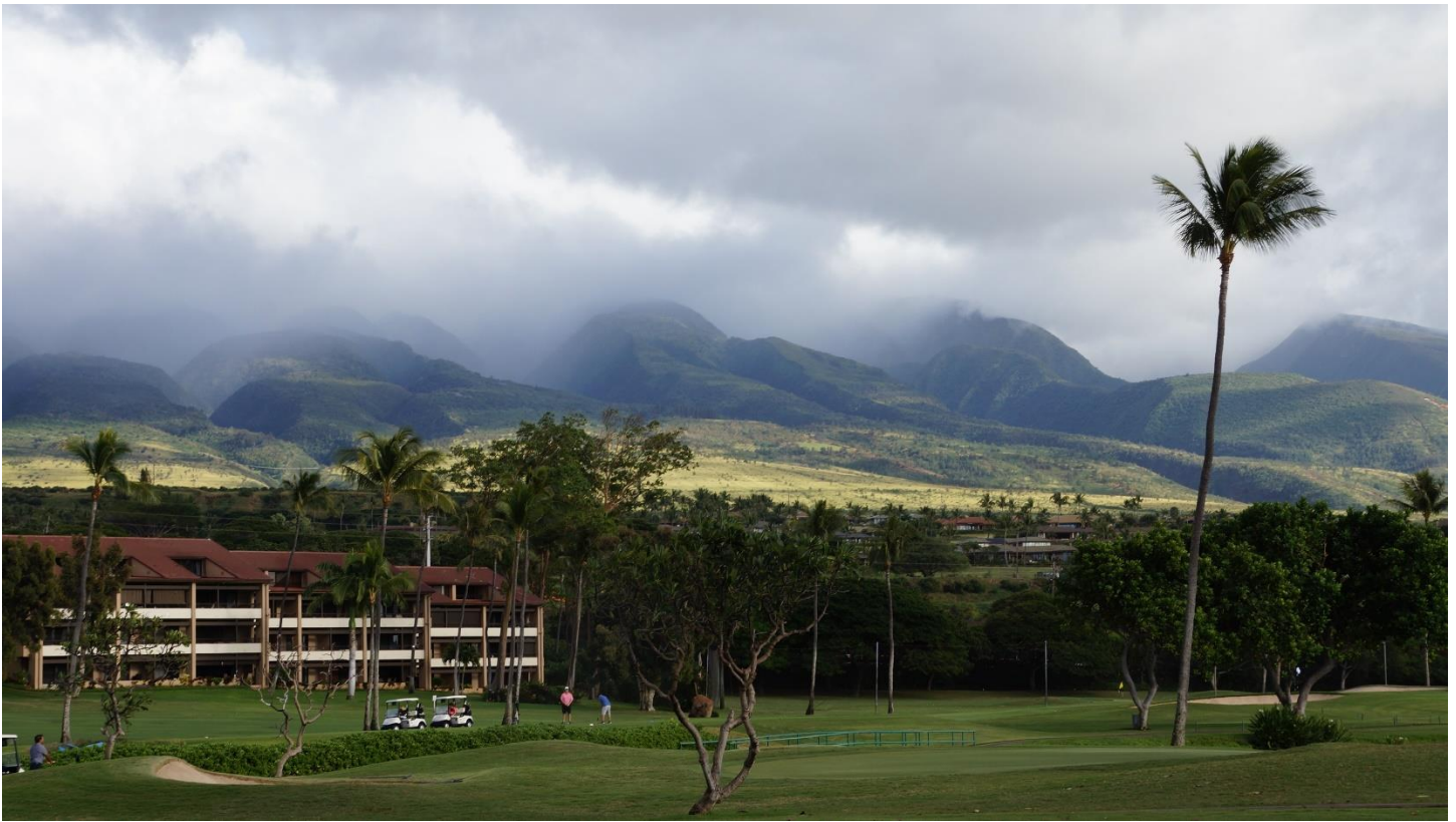
The view to the north with the mountains almost permanently encased in clouds.