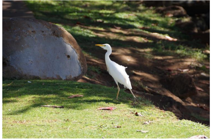
Above: Most birds are songbirds along the sea shore.