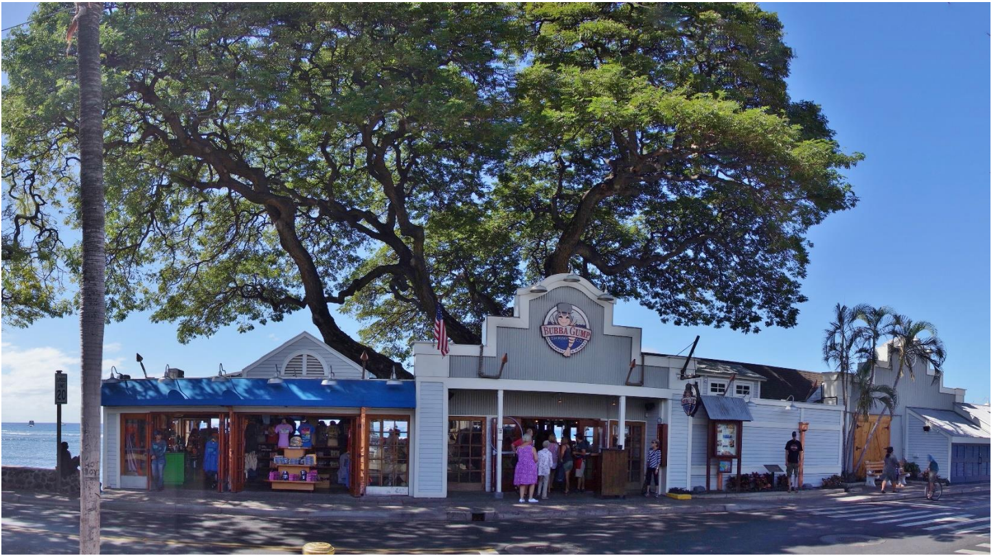
A tree grows out of the Bubba Gump Restaurant.