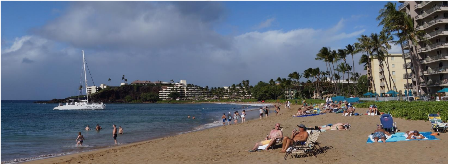
Kaanapali Beach, considered one of the best beaches in the world.