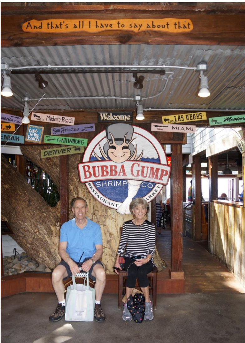
Two tourists 3,298 miles from home checking out the tree.