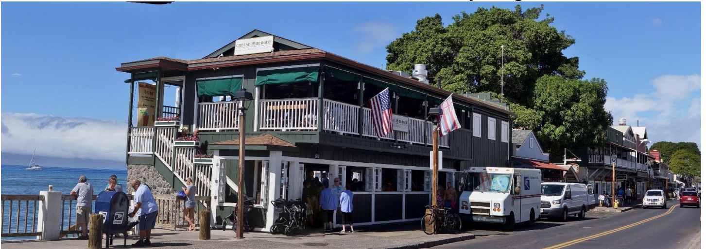
The walkway goes almost to the largest city on the island, Lahaina.