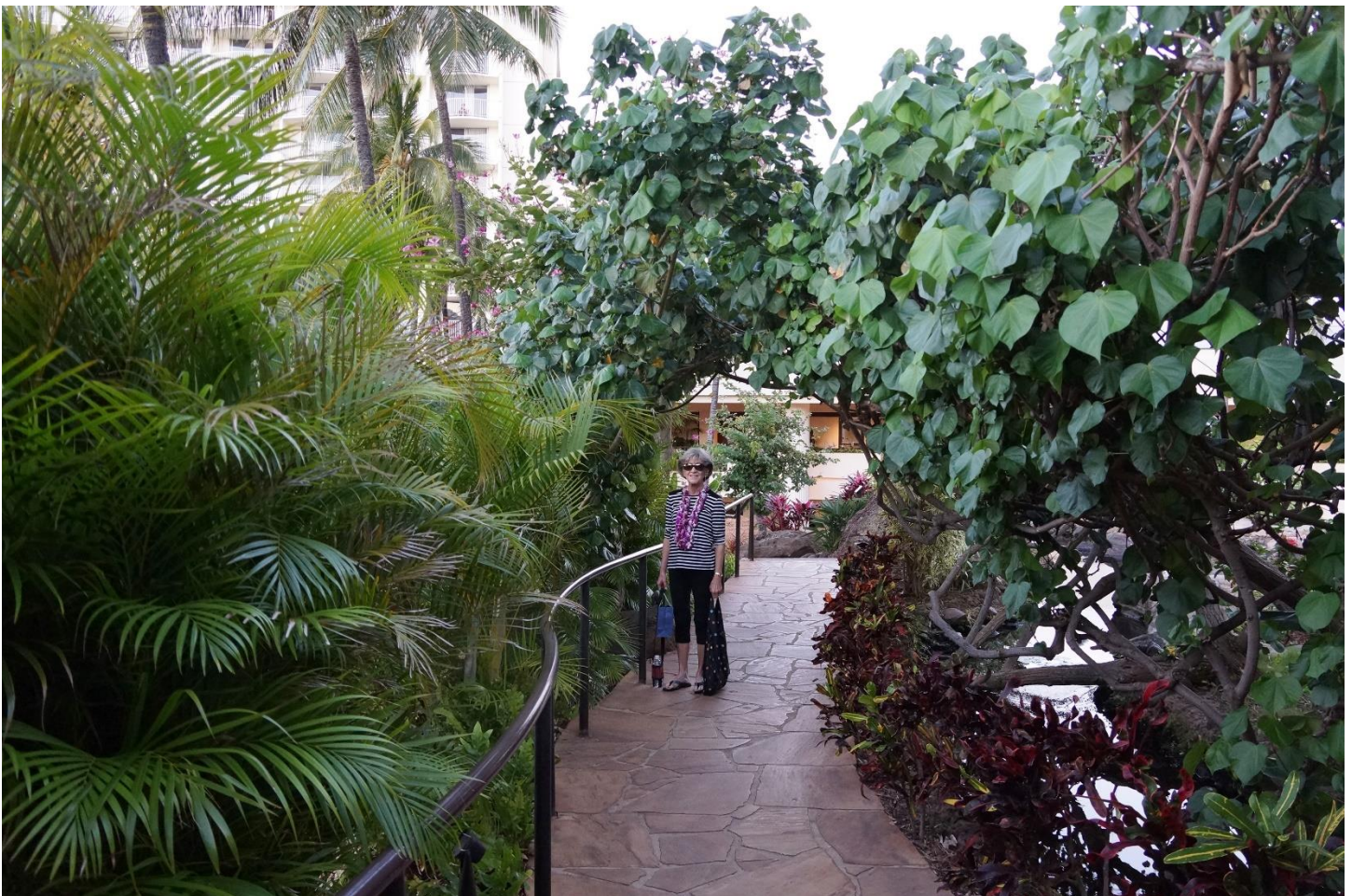
Stopping to see one of the many Botanical Gardens at the Resort Hotels.