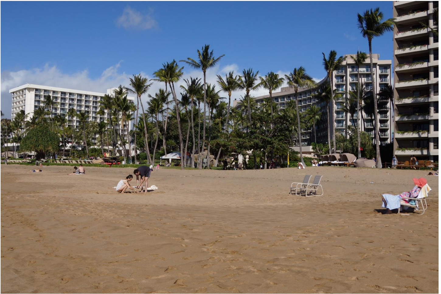
The Kaanapali Beach has many fabulous Resorts including Westin Resort. Below a pool at Westin's Kaanapali Resort.