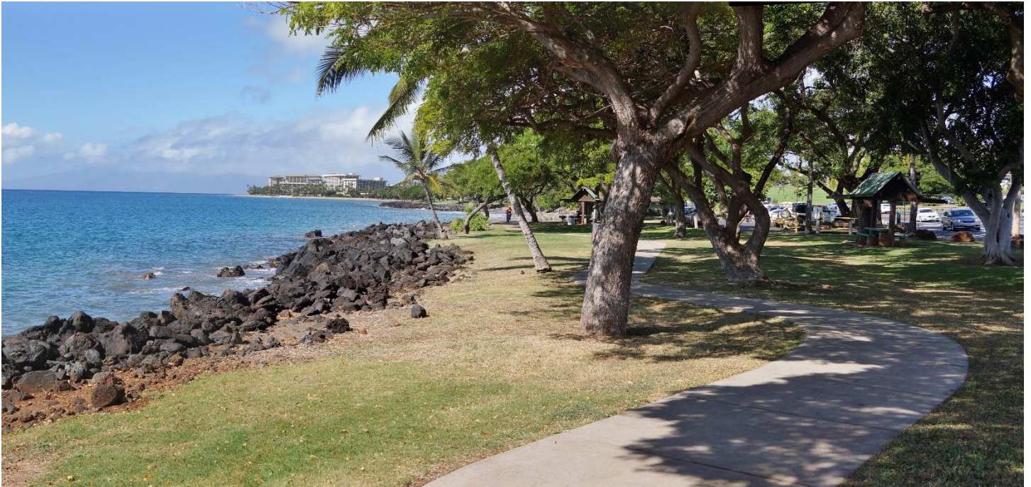
The east side toward Lahaina has a 5 mile walkway along the shore.