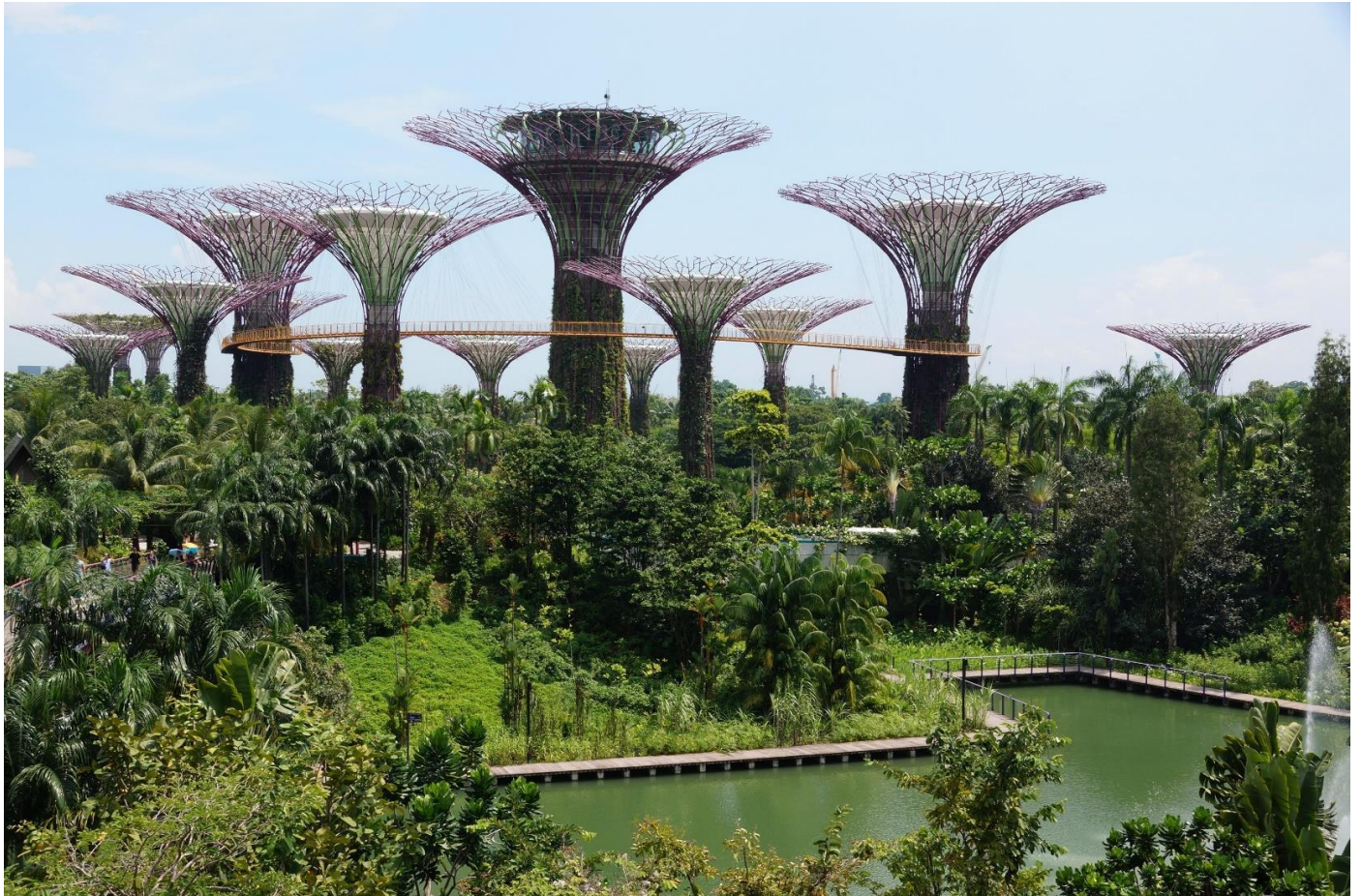
At night the park has a light show with fantastic music.