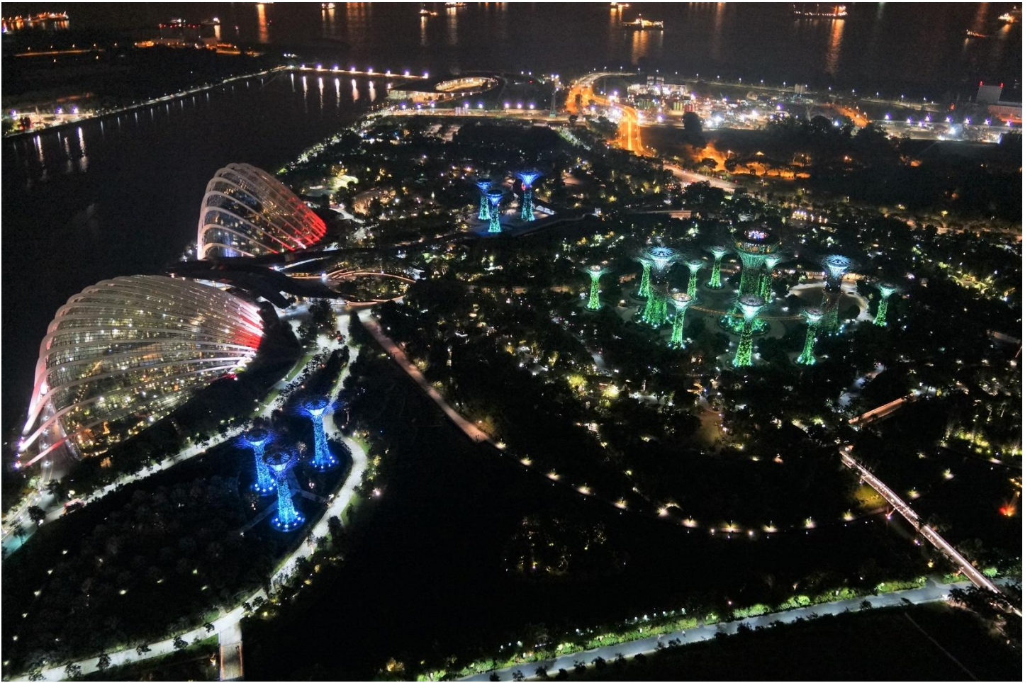
Gardens by the Bay at night from the Marina Sands Casino and below from the Singapore Flyer.