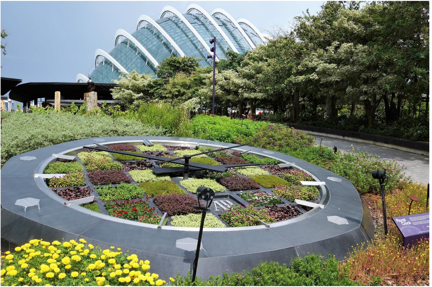
The Gardens has a clock made from flowers and a walkway from above.