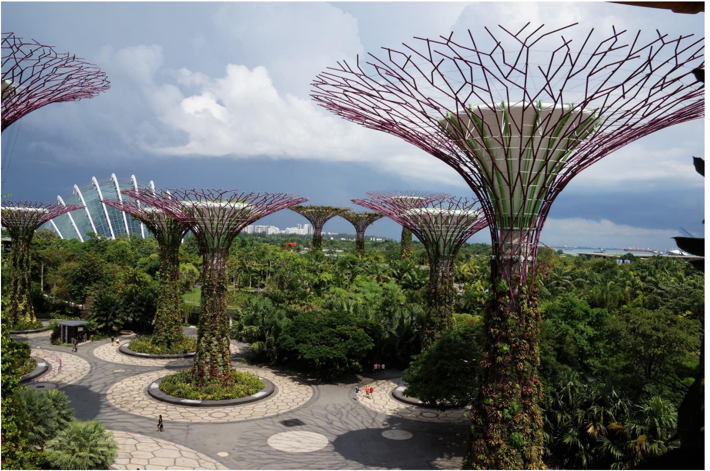
The man made trees have vines growing on them to eventually create a totally new living tree.